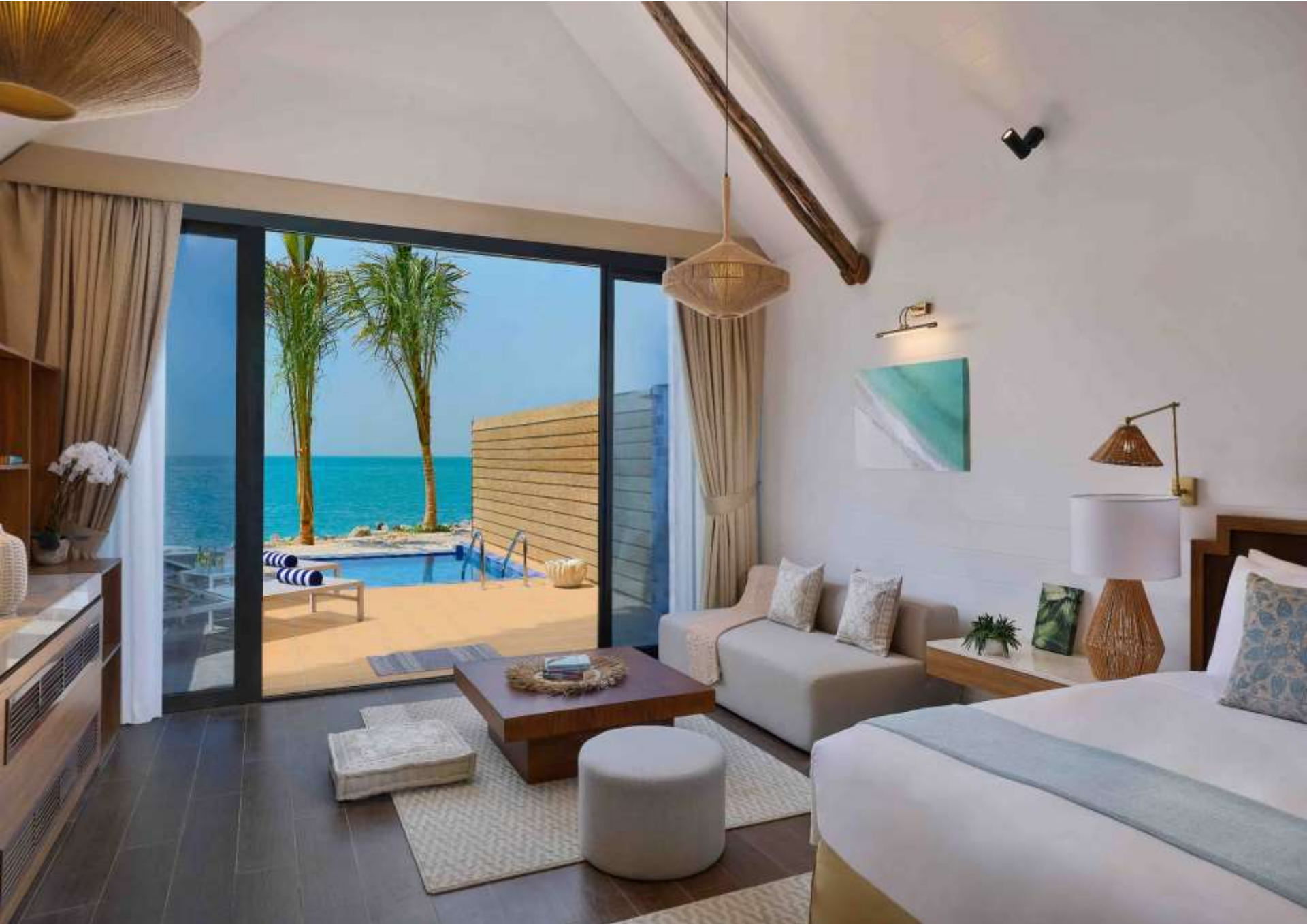
Anantara One Bedroom Garden Pool Villa