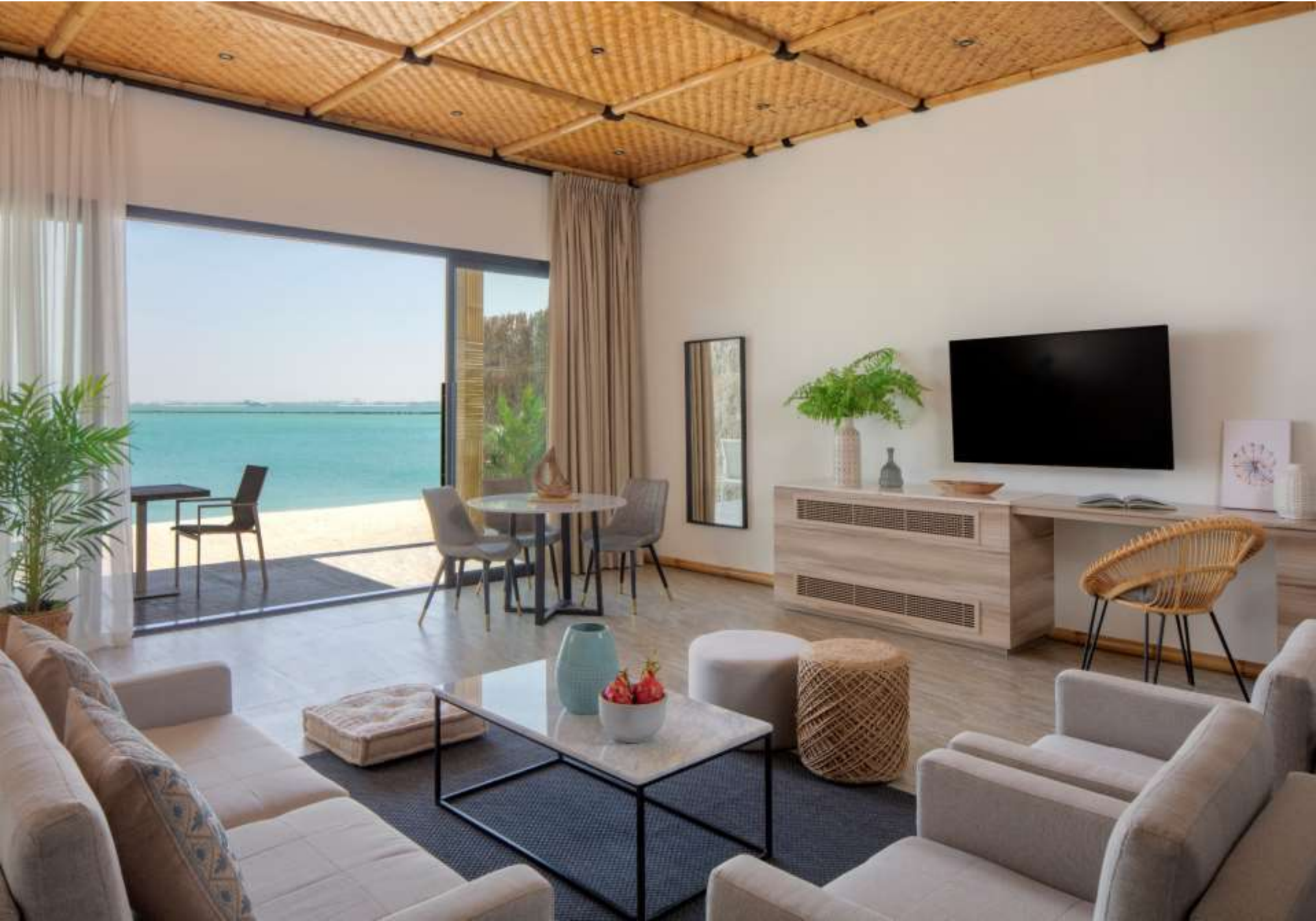
Junior Beach Access Suite