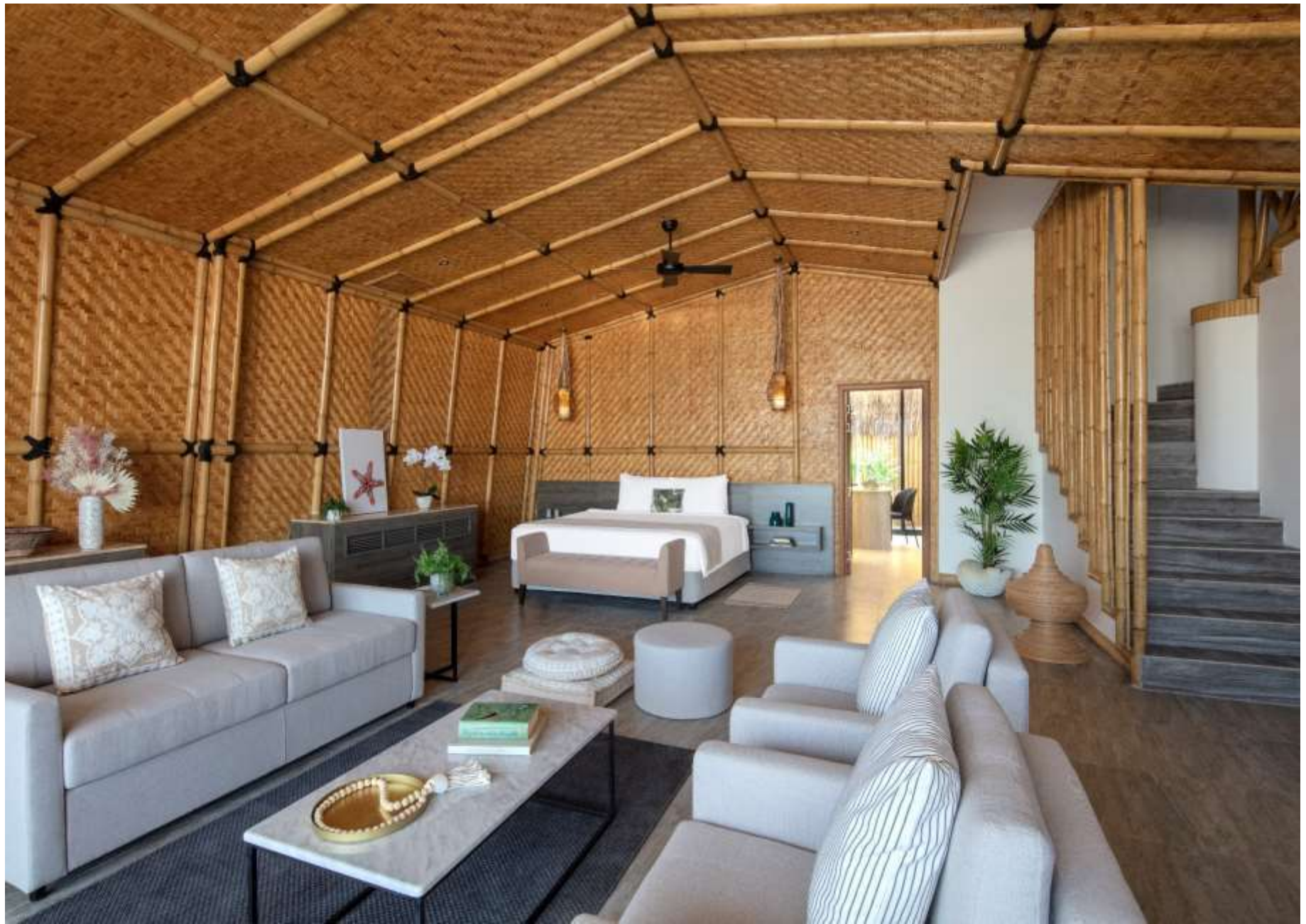
Two Bedroom Beach Pool Villa