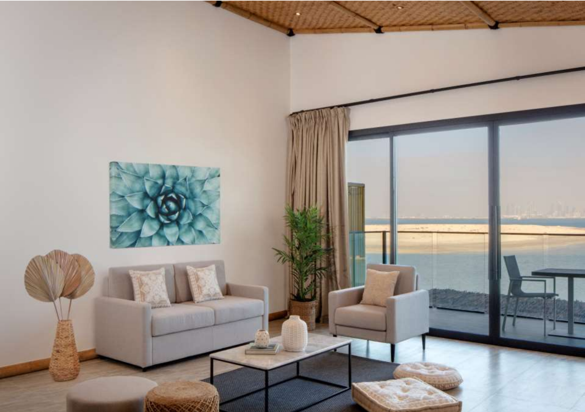
Junior Ocean View Suite