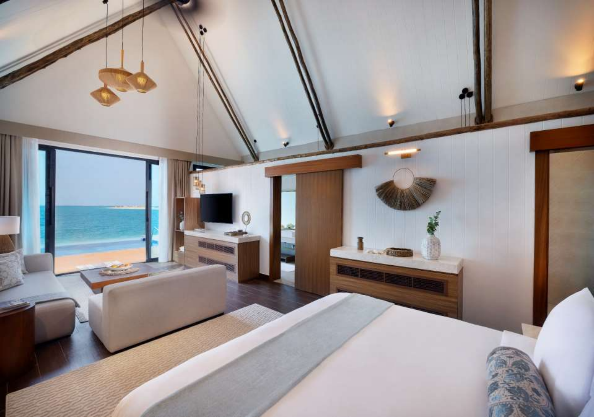
Anantara One Bedroom Beach Pool Villa