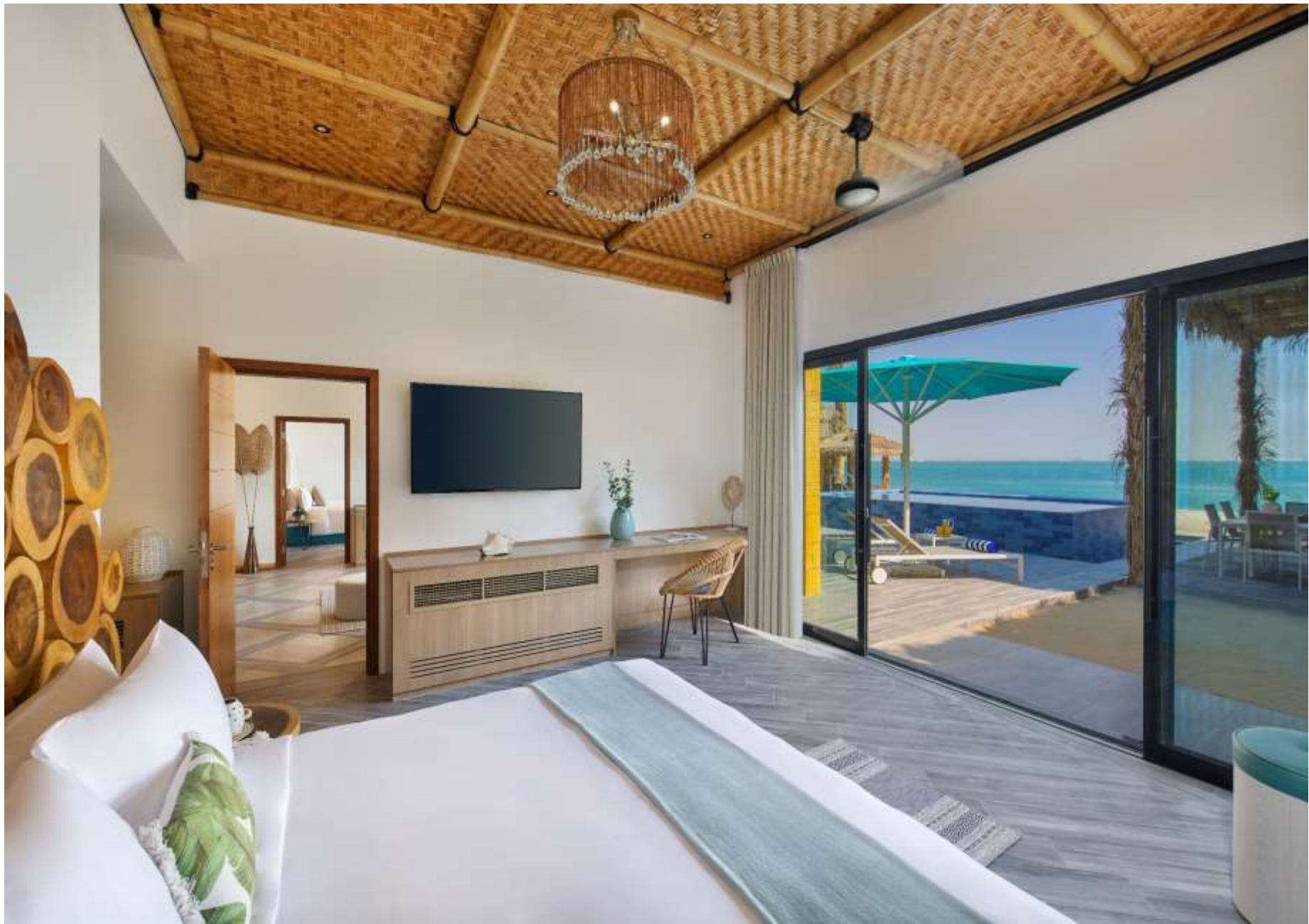
Four Bedroom Beach Pool Villa