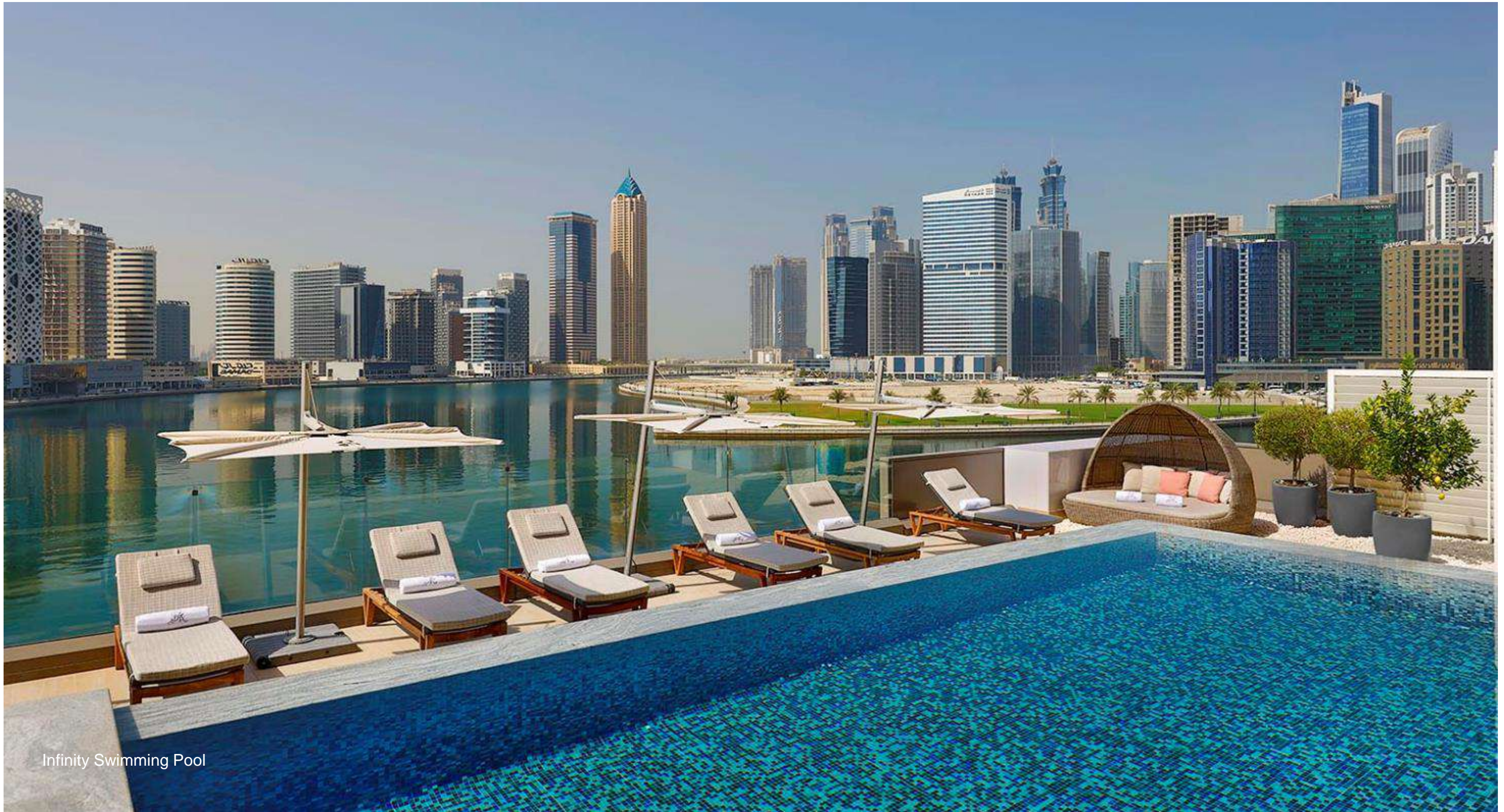
Infinity Swimming Pool