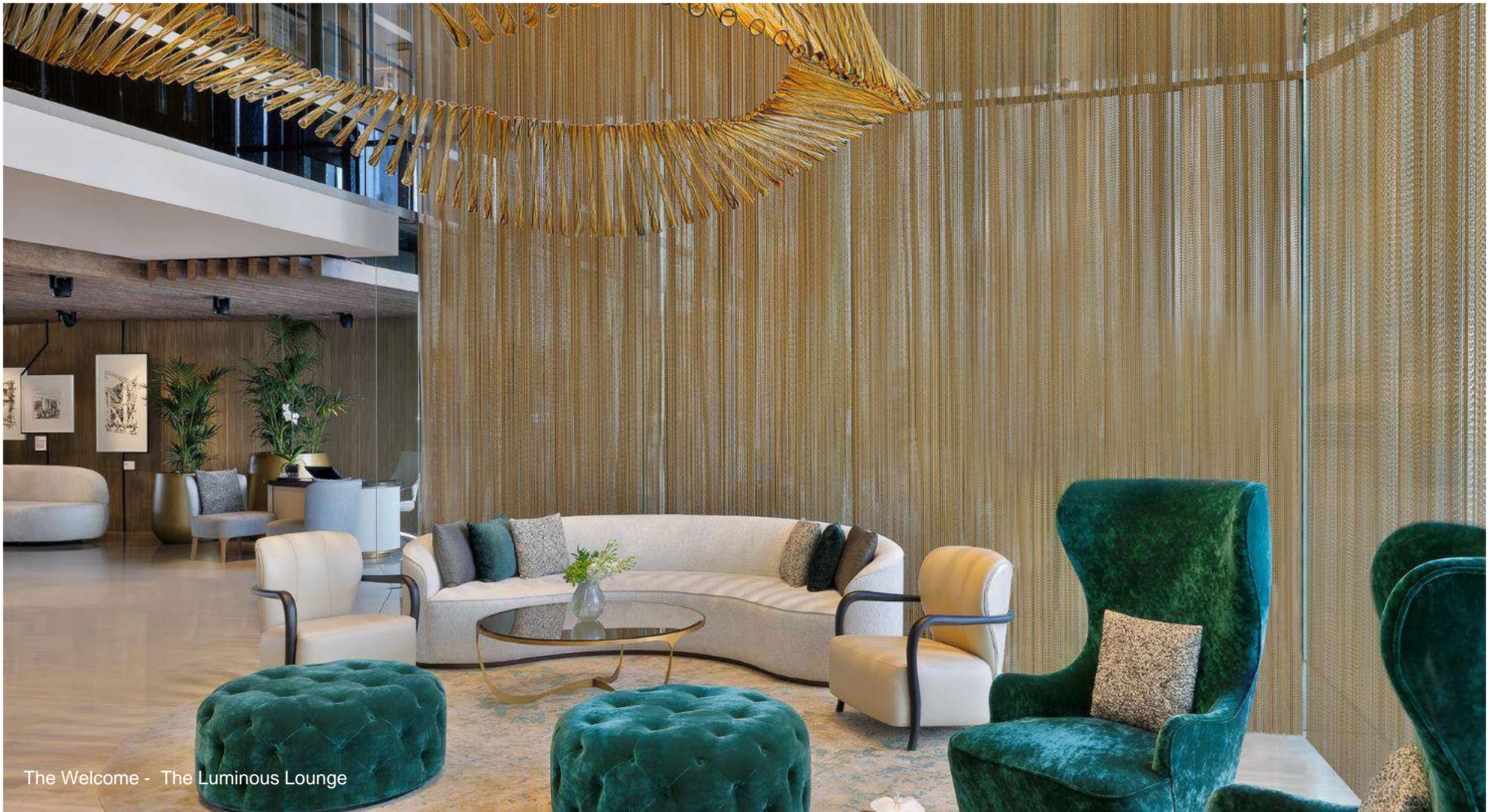
The Welcome - The Luminous Lounge