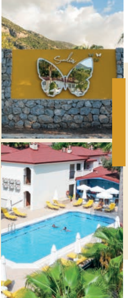
*The Silence Pool is only allowed from 16 years of age. Opening times are 09.00 a.m. to 19.00 p.m. *Sun beds, umbrellas and pool&Beach towels are free. Units, activities, opening / closing tmes vary according to season and weather conditons.