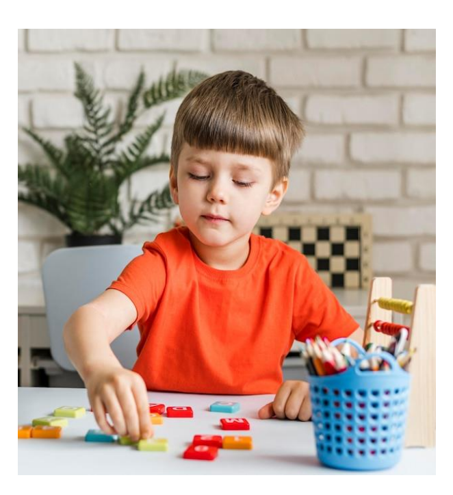
Lego corner for kids next to the Lobby will be organized.