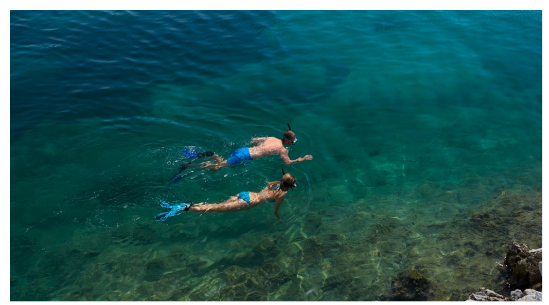
Surrounded by the ocean and vivid green hills, the many pools of Mandarin Oriental, Bodrum invite you to swim laps under the sun or unwind poolside.