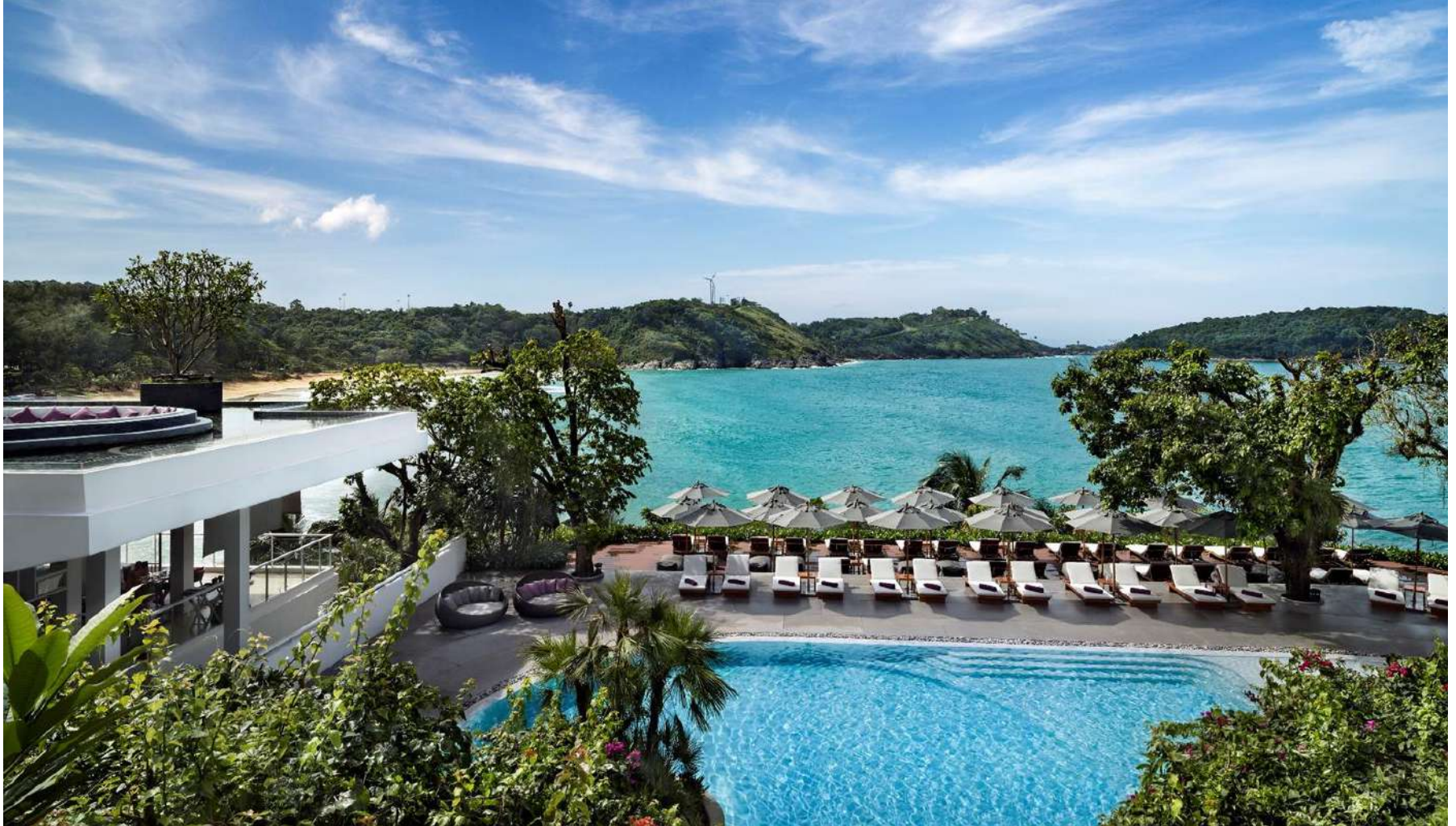
Swimming Pool with stunning view over the bay