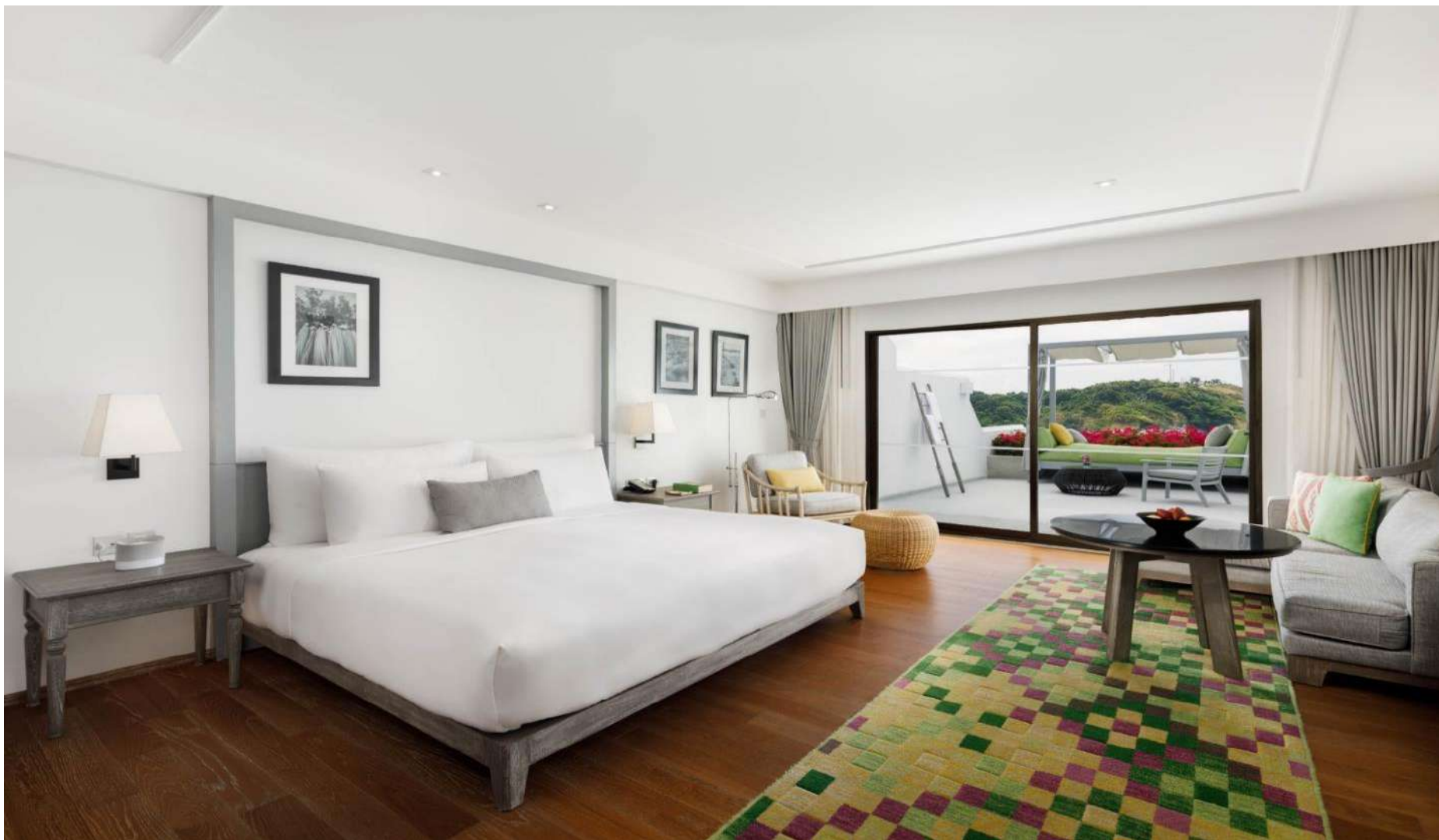
Grand Ocean View Room – 59 rooms, 81 sq.m Located from the 1 st to 7 th floor of the resort.