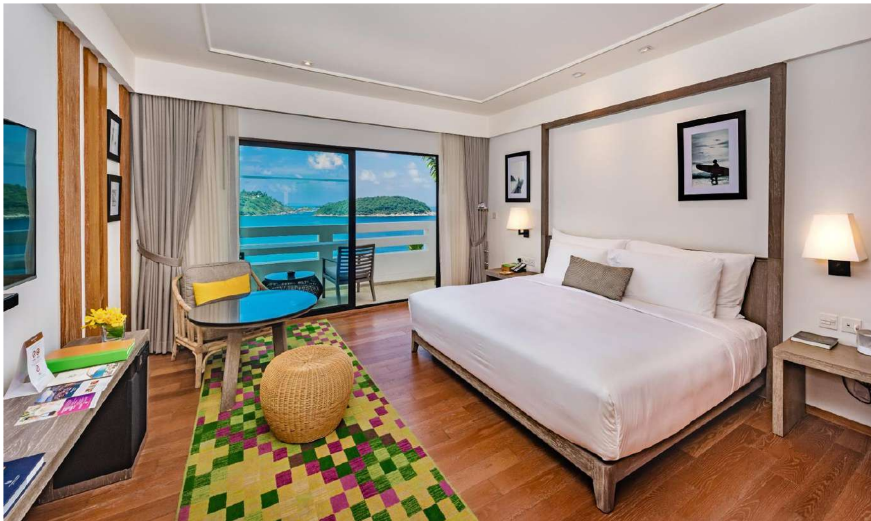
Deluxe Ocean View Room – 11 rooms, 47 sq.m Located on the top 2 levels of the hotel (8th and 9th floors).