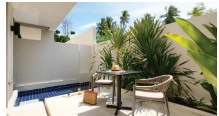
Plunge Pool Suite – 50sqm Relax in privacy with your own secluded garden terrace and private plunge pool. Each room features an en-suite bathroom with separate shower and bathtub.