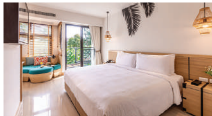
Superior Pool View Room – 26sqm This bright and modern room offers private balcony with a view over the swimming pool. King or twin beds are available.