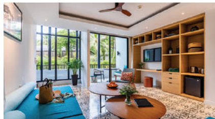
Grand Surin Suite – 70sqm This two-level suite features a spacious living room and a private balcony downstairs. Upstairs is the master bedroom with a bathroom and shower.