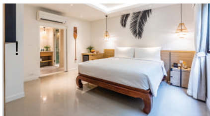
Superior Room – 30sqm Modern and comfortable rooms, featuring a king-size bed. Good choice for couples.