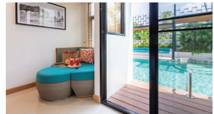
Deluxe Pool Access Room – 26sqm Modern and stylish room featuring small private terrace with direct access to the resort's swimming pool. King or twin beds are available.