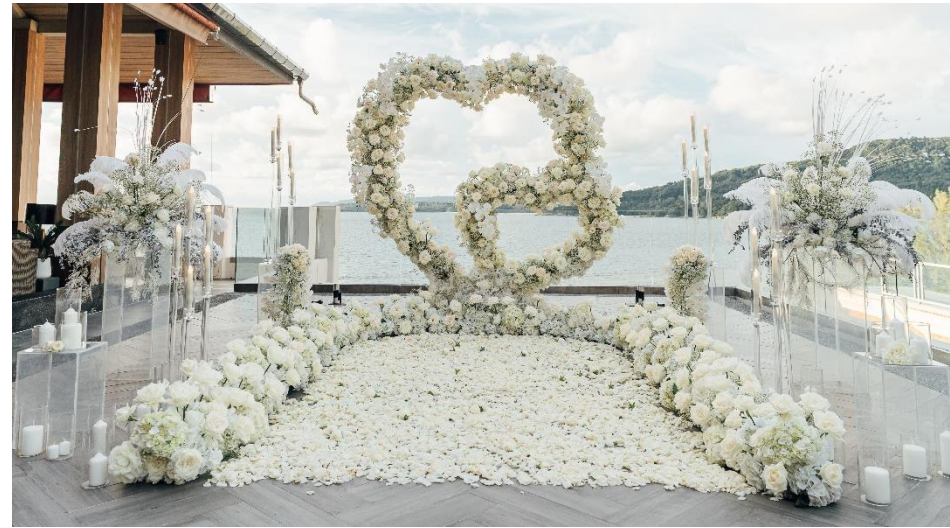
THB 30,000 net (Emerald's standard design with local flowers)