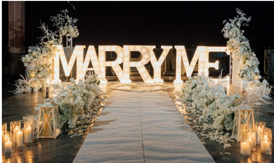
THB 20,000 net (Emerald's standard design with local flowers)