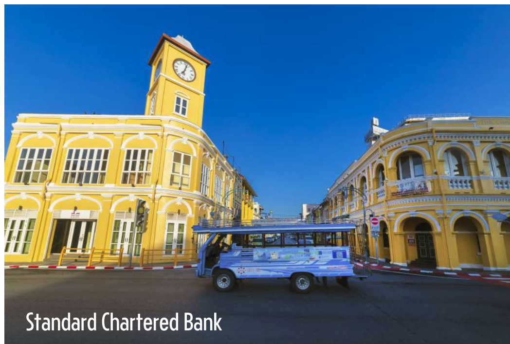
Standard Chartered Bank