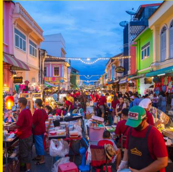
Sunday Night Market