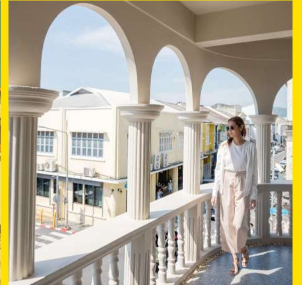
Cafés and Coffee Shops

Experience the essence of Phuket Old Town—a place where history meets contemporary charm, inviting you to explore, indulge, and create lasting memories.