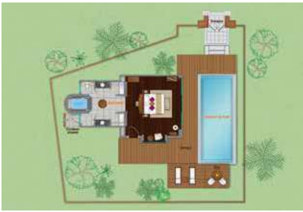
Sala Pool Villa