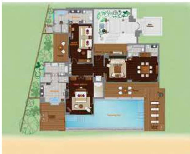
Two Bedroom Anantara Pool Villa