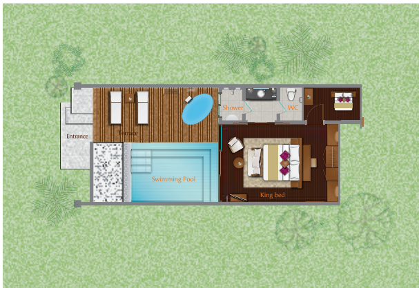
Family Pool Villa