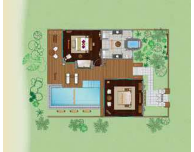
Beachfront Layan Pool Villa