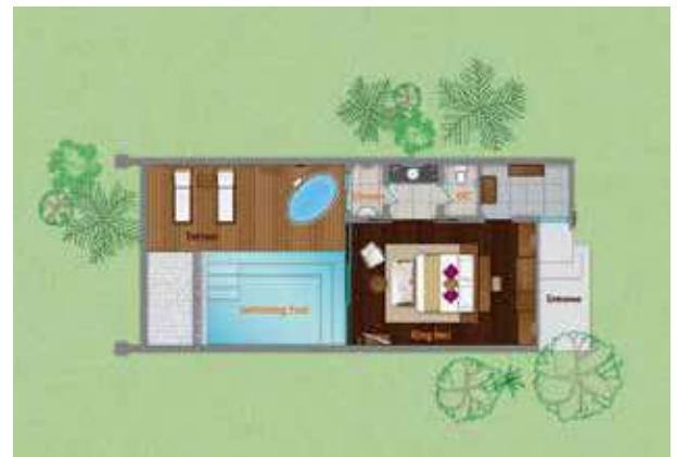
Deluxe Pool Villa