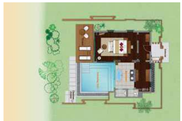
Beach Access Pool Villa