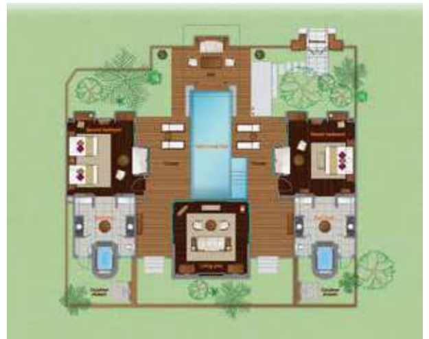
Two Bedroom Layan Pool Villa