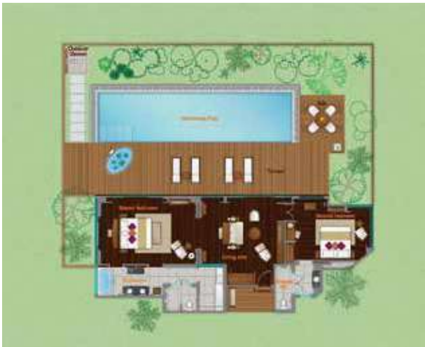
Two Bedroom Pool Villa