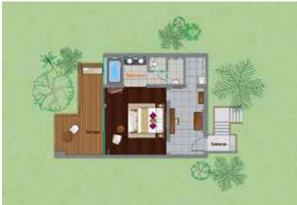
Deluxe Layan Suite