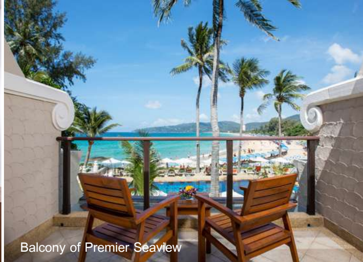
Balcony of Premier Seaview