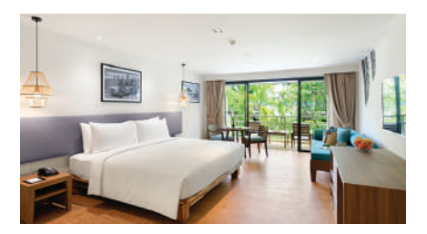
Deluxe Garden Balcony – 40sqm Contemporary room offering a spacious living space and a view of the tropical gardens with a private balcony. Bathroom features a walk-in shower.

Enjoy a terrace with private swimming pool, a spacious bedroom with a walk-in wardrobe and an extensive bathroom featuring a bathtub and shower.