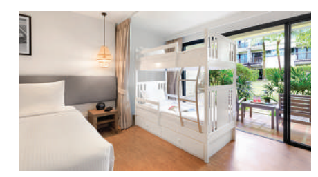
Family Garden Terrace - 40sqm Well-designed, offering enough space for two adults and two children. This family room features a king-size bed, bunk beds and a playstation corner that can be screened off for privacy.

Enjoy extra space. The Premier Garden Suite features a separate living room with a sofa, separate bedroom with a walk-in wardrobe and a deluxe bathroom.