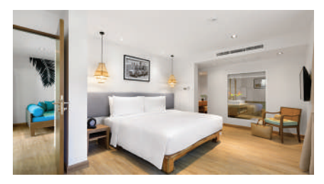
Premier Garden Suite - 77sqm

Enjoy extra space. The Premier Garden Suite features a separate living room with a sofa, separate bedroom with a walk-in wardrobe and a deluxe bathroom.