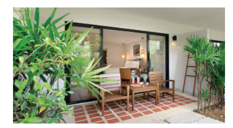
Deluxe Garden Terrace – 40sqm Located on the ground floor, this bright and spacious room opening onto a private terrace and connecting to the resorts tropical gardens.

Offering a wide terrace with views of lush resort gardens. The villa features modern bedroom and bathroom with a separate bathtub and shower