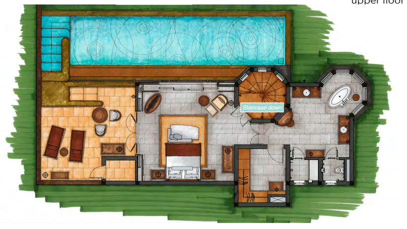
The two bedroom Cape Pool Villa is a combination of a Prestige Ocean View Villa and a Ocean View Pool Villa with connecting staircase