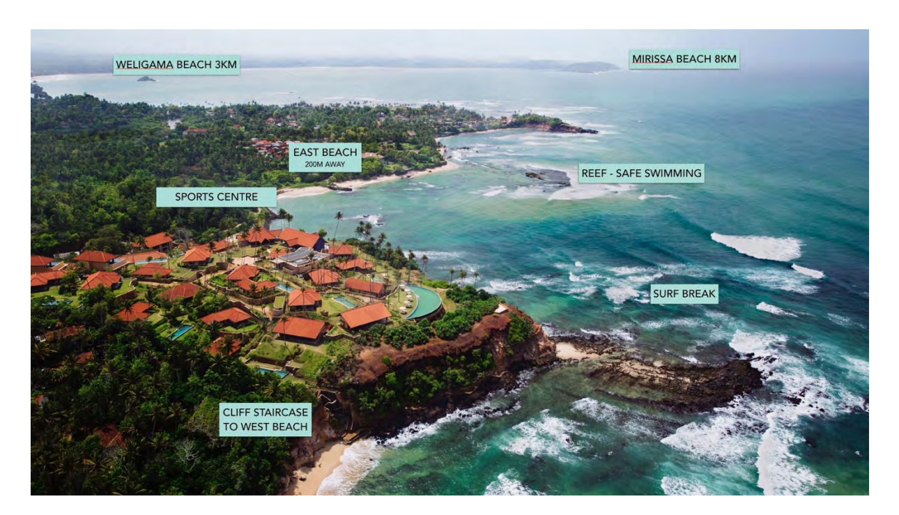
Cape Weligama beach map