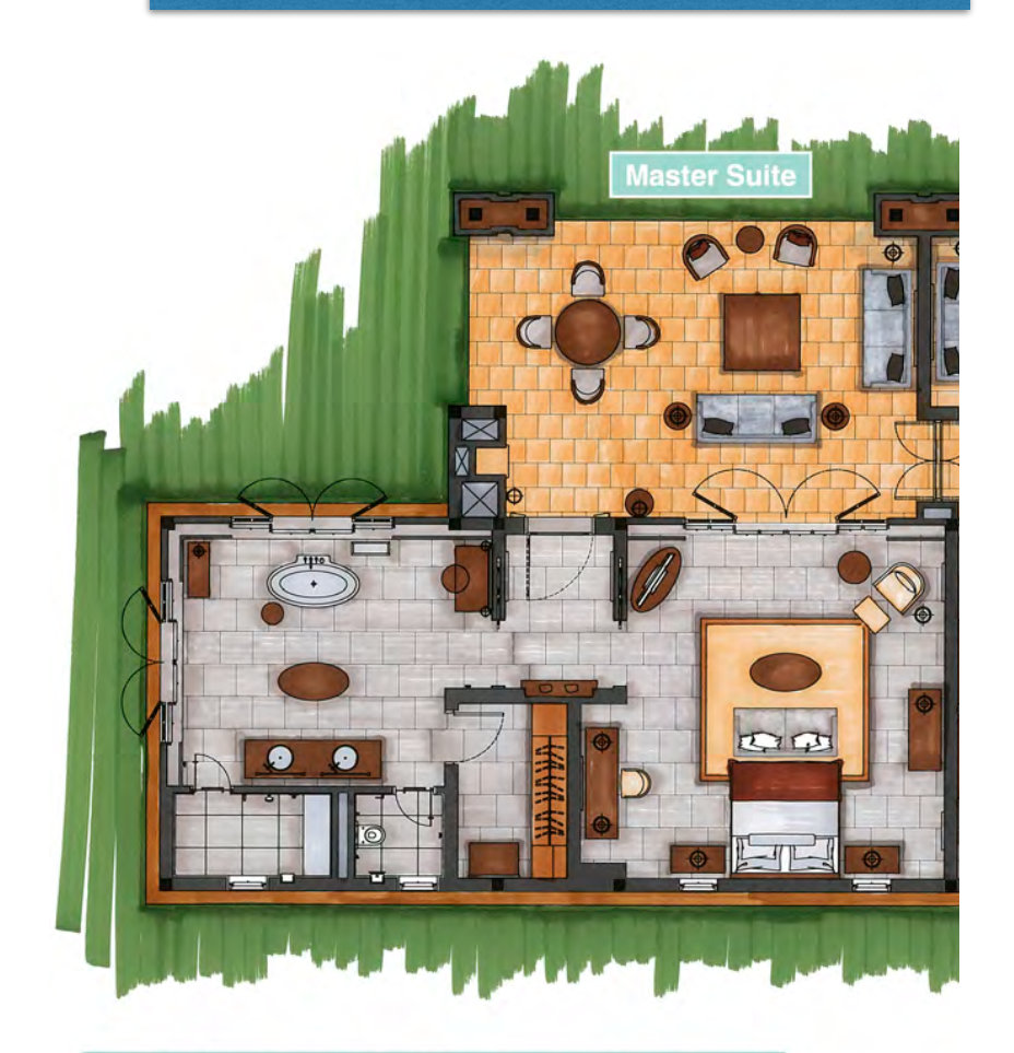
The Suites are in units of four, two up and two down