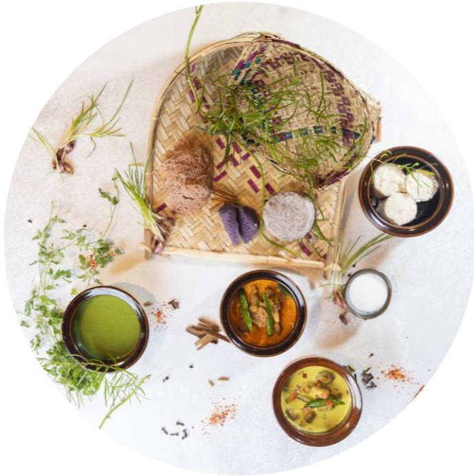
All Day Dining restaurant with indoor and al fresco seating