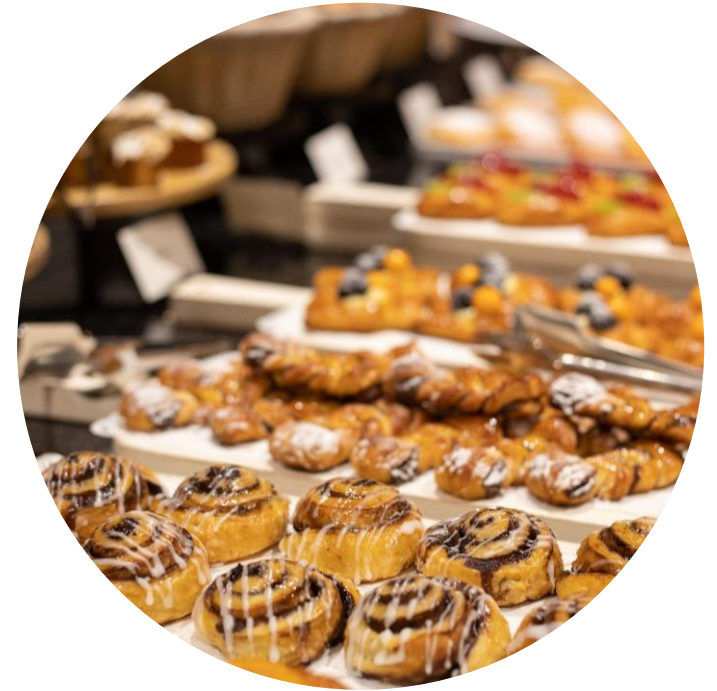
Serves authentic local, regional and western fare with an extensive buffet and a la carte mix