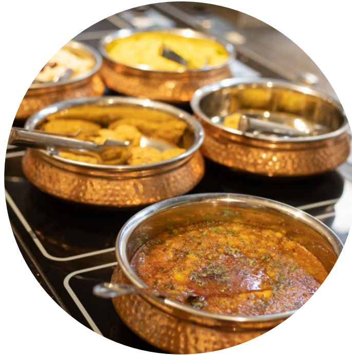
Seating capacity of 108 with in an elegant setting