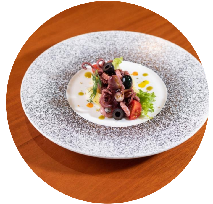
Mediterranean and Tapas food in a casual setting