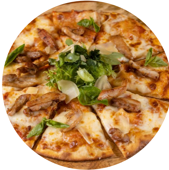
Open for Lunch and Dinner with a capacity of 60 covers