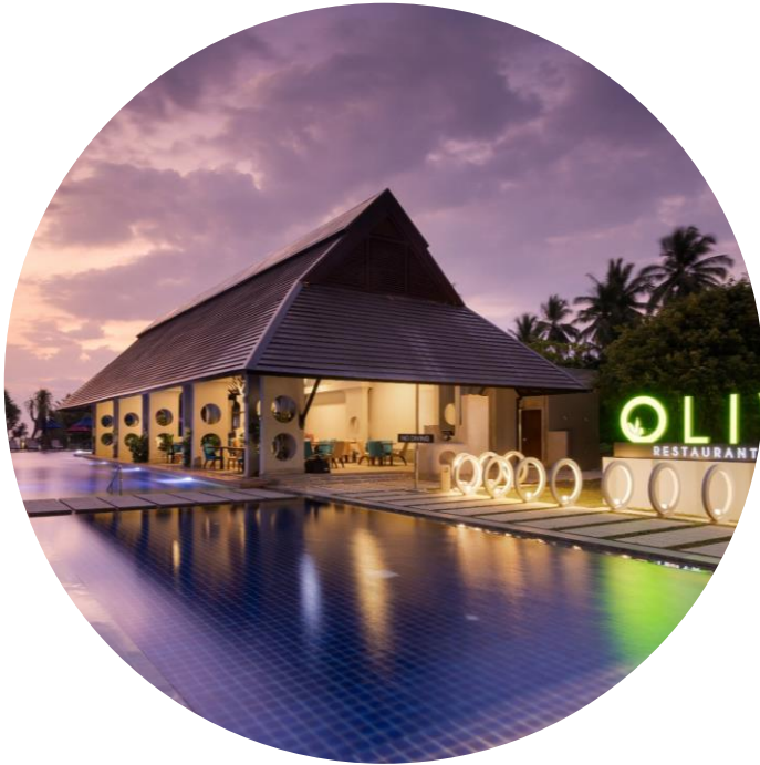
Al Fresco Dining with a bar set adjacent to the Pool