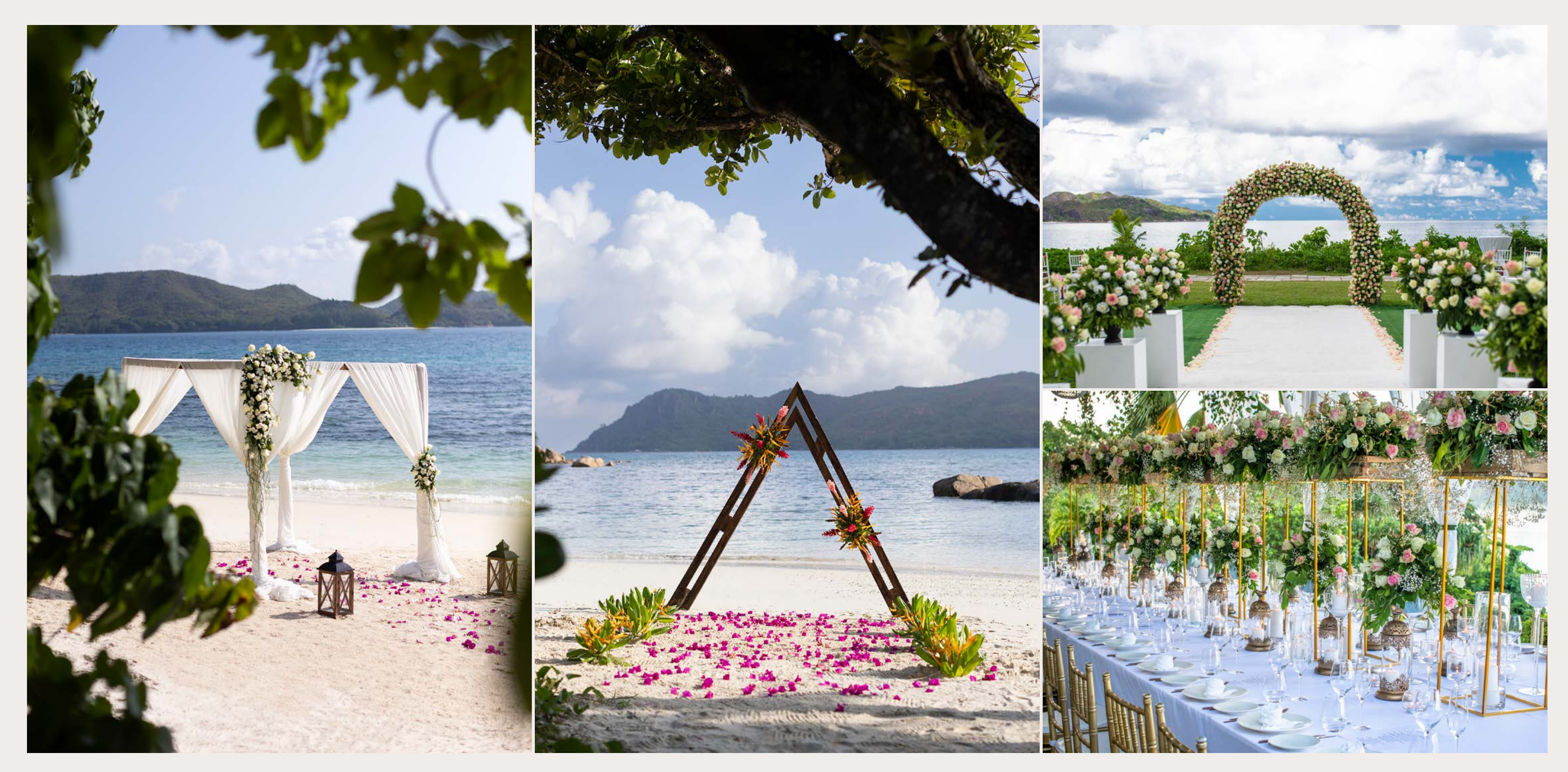
*Please note that wedding setups which include gazebos and deluxe arches are subject to extra charges in which a quotation can be provided for.