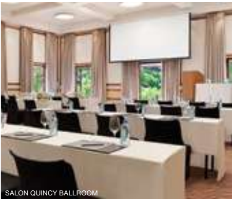
SALON QUINCY BALLROOM