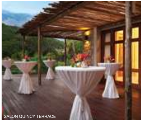
SALON QUINCY TERRACE