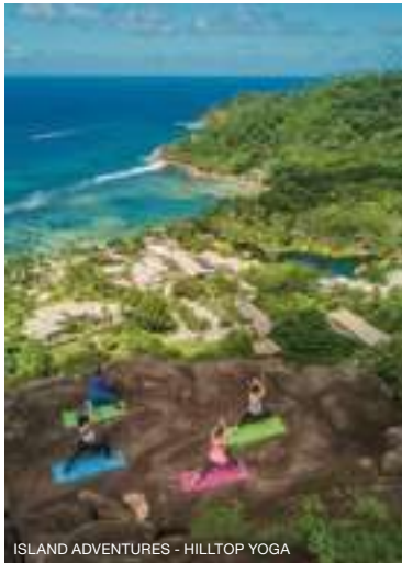
ISLAND ADVENTURES - HILLTOP YOGA