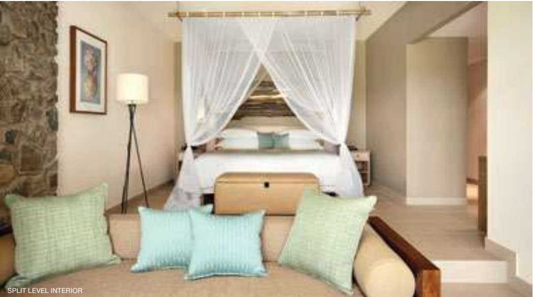
SPLIT LEVEL INTERIOR

A collection of spacious rooms and suites set in expansive tropical grounds, have been designed to blend harmoniously with their spectacular natural surroundings.