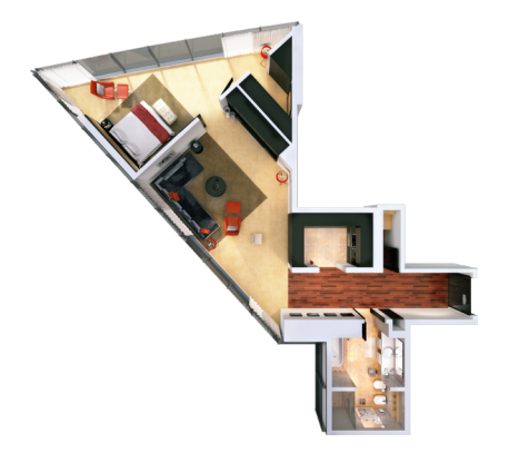
Witty Area 107 SQM