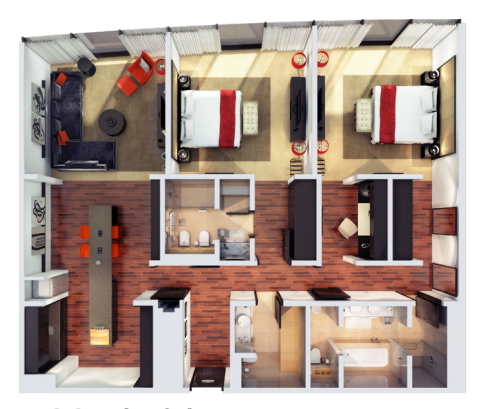
Wonderful Area 143 SQM

Contact Details W Doha Hotel & Residences, West Bay Area, Doha. PO Box 19573, Qatar T. +974 4453 5000 F. +974 4453 5354