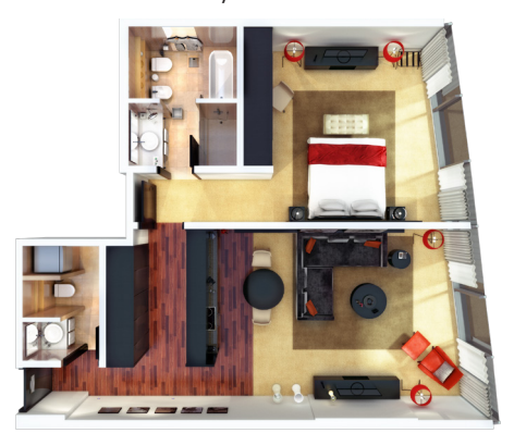
Warm Area 73 SQM