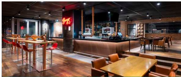
Stock Burger Co.