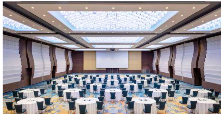
Al Masa Ballroom

This fully private room is at the Mezzanine Level, directly above Al Masa Ballroom, ideal for pre-event functions or for the bride's wedding day preparations.