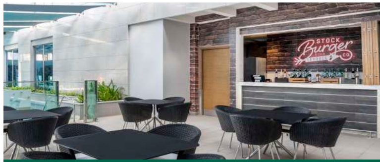
Stock Burger Co. Terrace