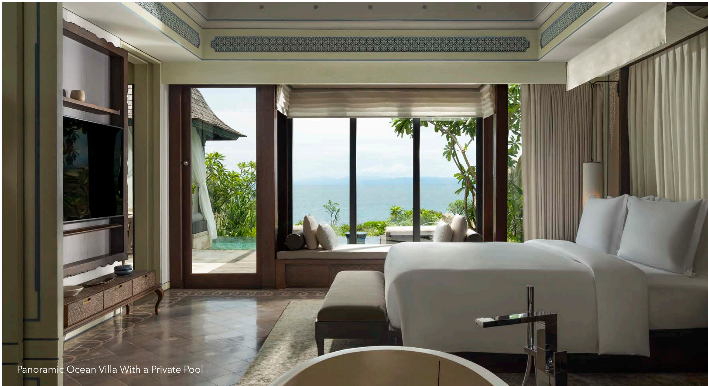
Panoramic Ocean Villa With a Private Pool