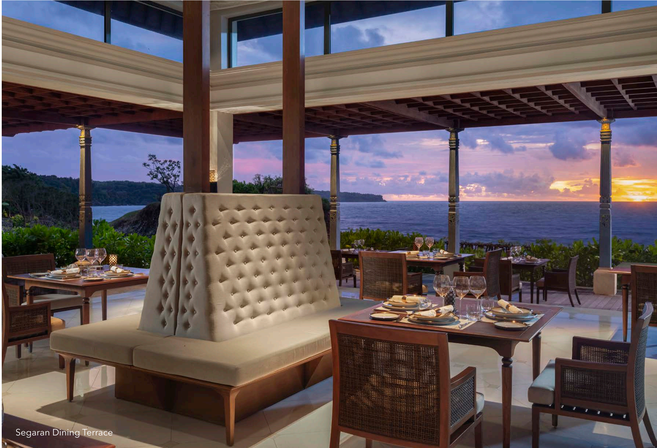
Segaran Dining Terrace

Jumeirah Bali guests are guaranteed exceptional dining experiences at its three signature restaurants and bars overseen by Master Chef Vincent Leroux, each offering awe-inspiring views across the island's crystal blue waters and stunning sunset panoramas.