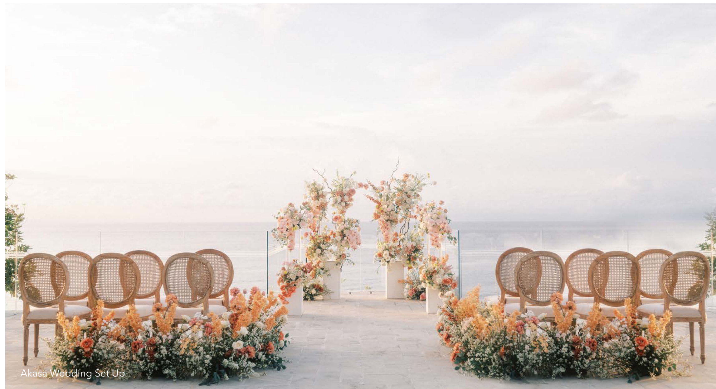
Akasa Wedding Set Up

Spacious enough to accommodate up to 180 guests theatre style and 100 for a sit-down dinner, our elegant ballroom offers a flexible event space that can be configured for private gatherings both large and intimate, in traditional or avant-garde styles. Ideal for alfresco celebrations in the soothing presence of water, the manicured Trowulan Lawn is an expansion of our signature wedding venue, the Trowulan Court, and can accommodate up to 200 guests banquet style.