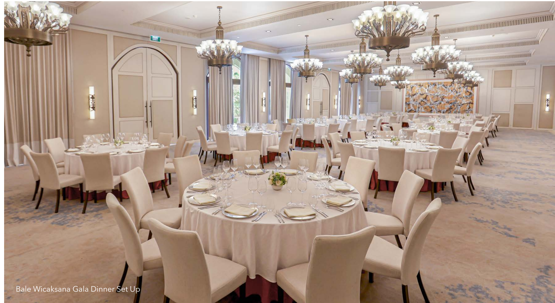
Bale Wicaksana Gala Dinner Set Up