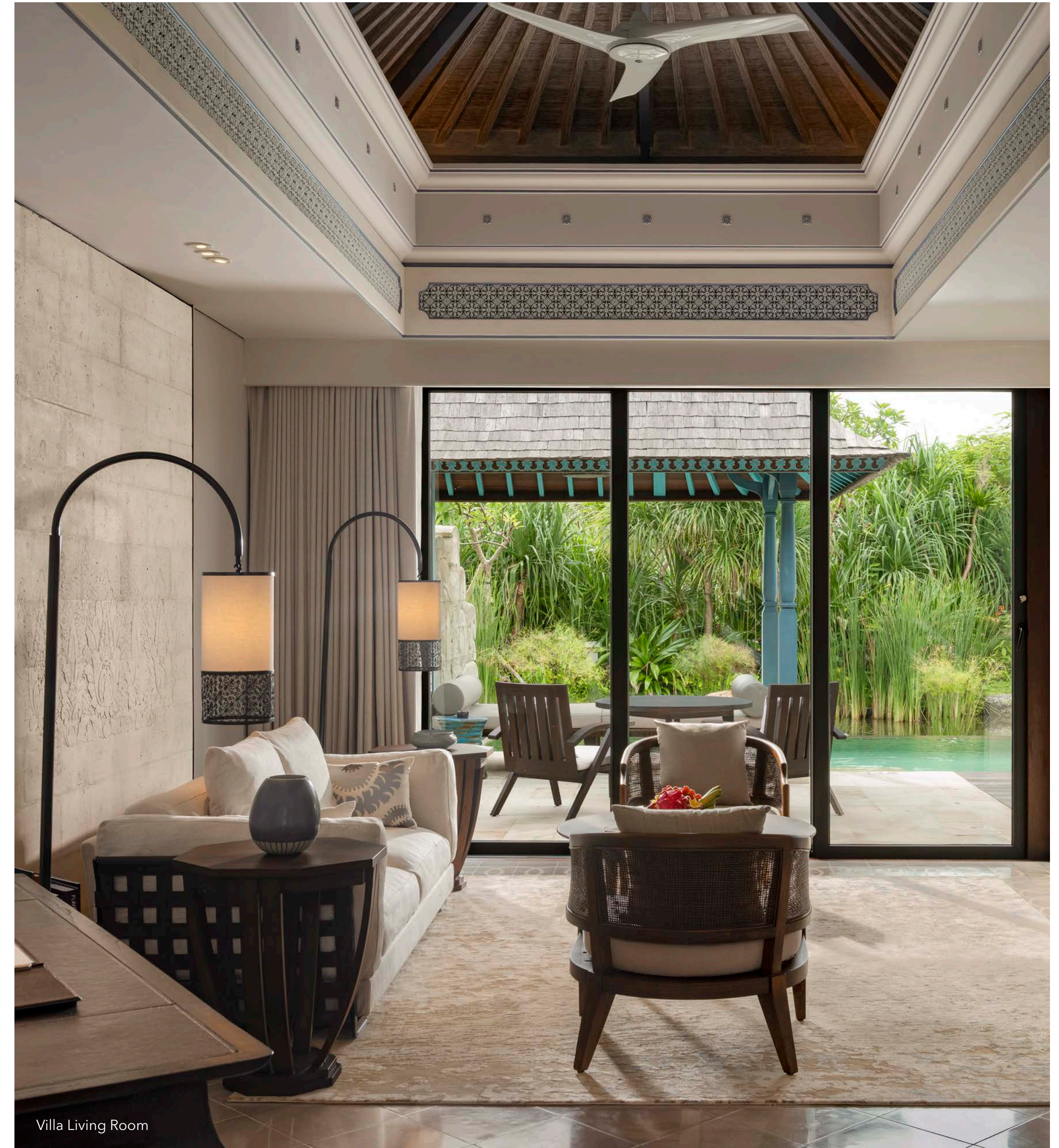
Villa Living Room

Blending indigenous building materials with contemporary and luxurious comfort to provide a sense of timeless elegance, the resort features dark stone structures, traditional carvings and statues, pools and fountains with floating plants and colourful fish. Combined with impeccably kept gardens and lush surroundings, guests are transported to an authentic Balinese haven of understated elegance with an opulent touch.