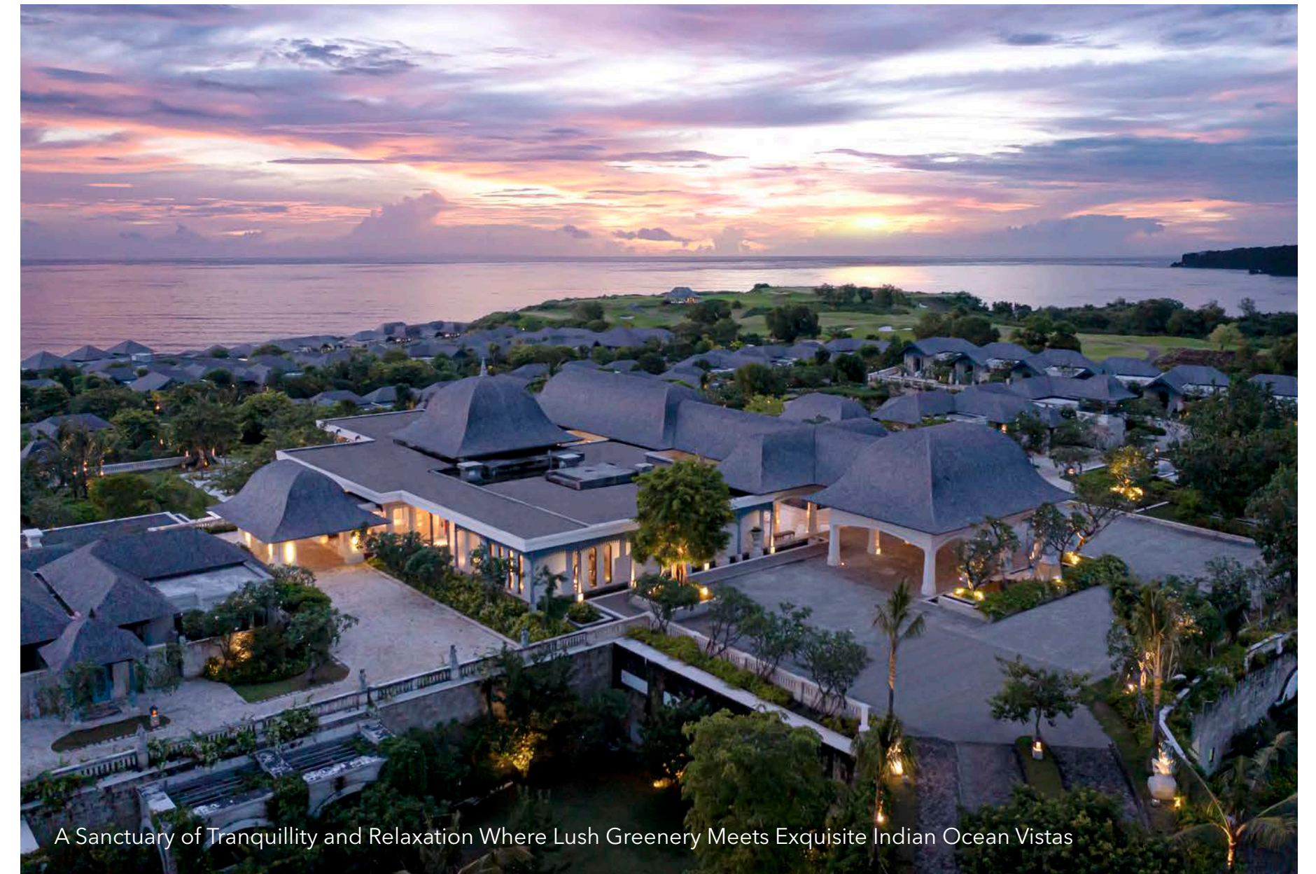
A Sanctuary of Tranquility and Relaxation Where Lush Greenery Meets Exquisite Indian Ocean Vistas