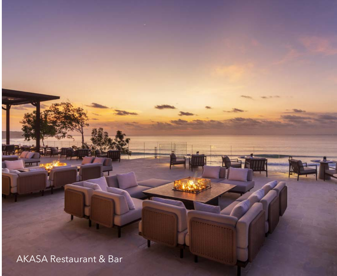
AKASA Restaurant & Bar