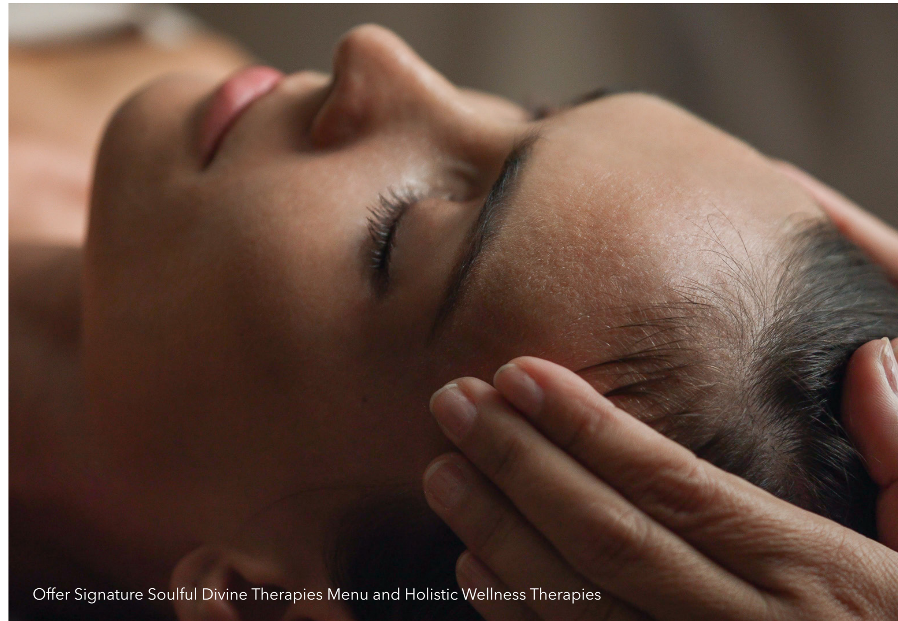
Offer Signature Soulful Divine Therapies Menu and Holistic Wellness Therapies