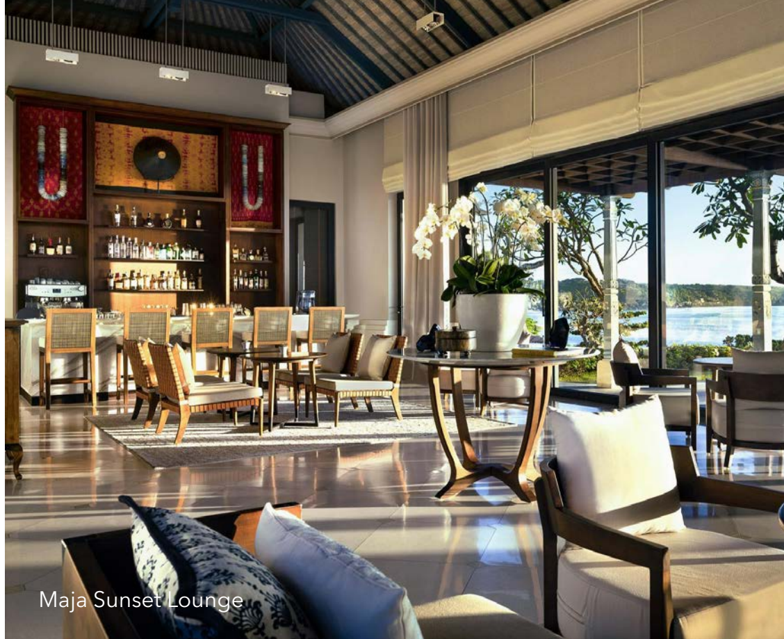
Maja Sunset Lounge