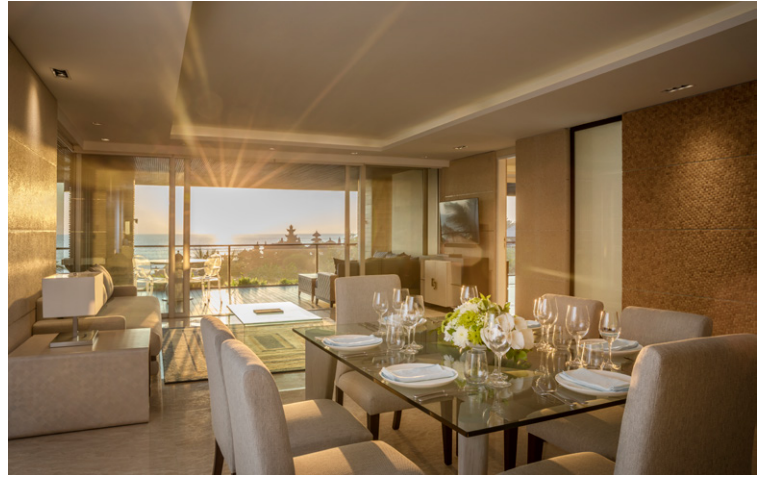
COMO Penthouse Dining Room