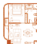
One Bedroom Suite