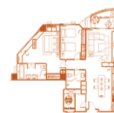
Two Bedroom Suite