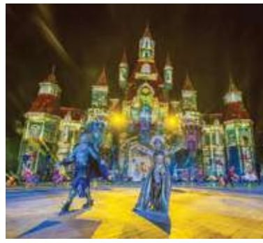
Tata Show - VinWonders Nha Trang