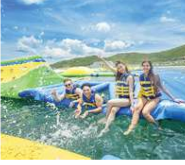
Water Park - VinWonders Nha Trang