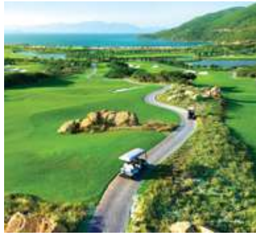
Vinpearl Golf Nha Trang