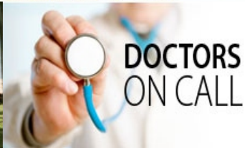
DOCTORS ON CALL