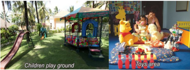
Children play ground

Unique services: sauna, steam bath, Jacuzzi, living room with bar & kitchen (President 2 bedrooms), 24/7 in-room services, ATM, air & boat tickets, trekking, snorkeling & diving, fishing & squid fishing.