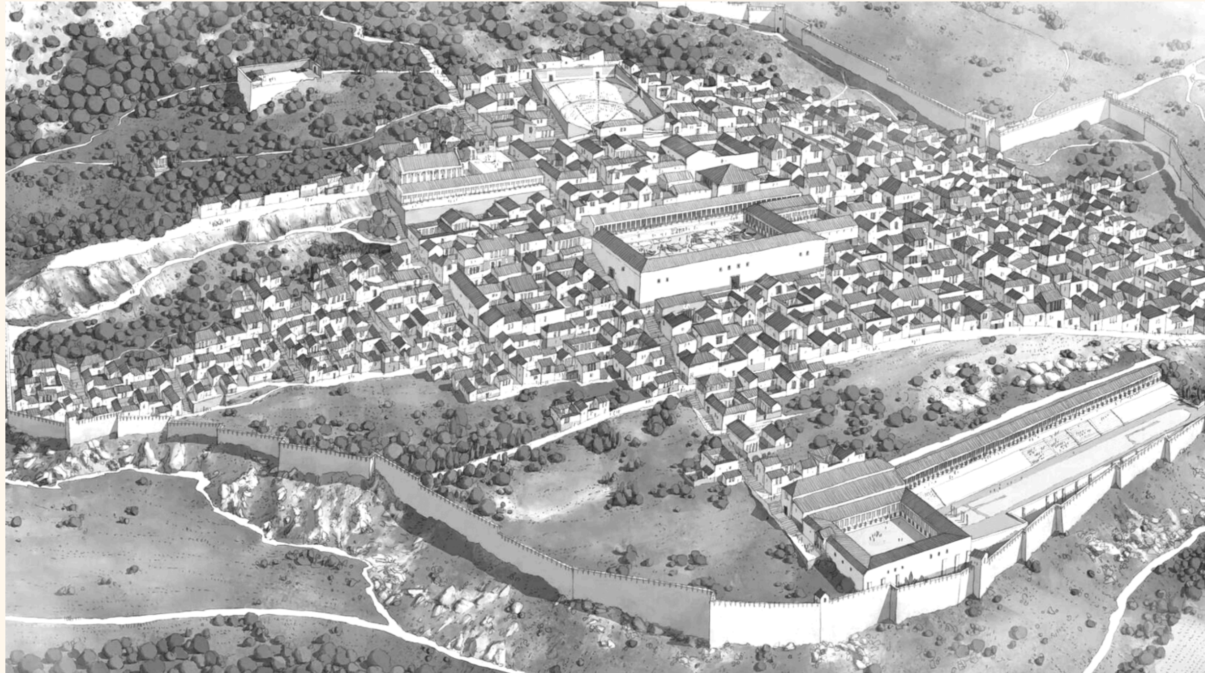
PRIENE ANCIENT CITY