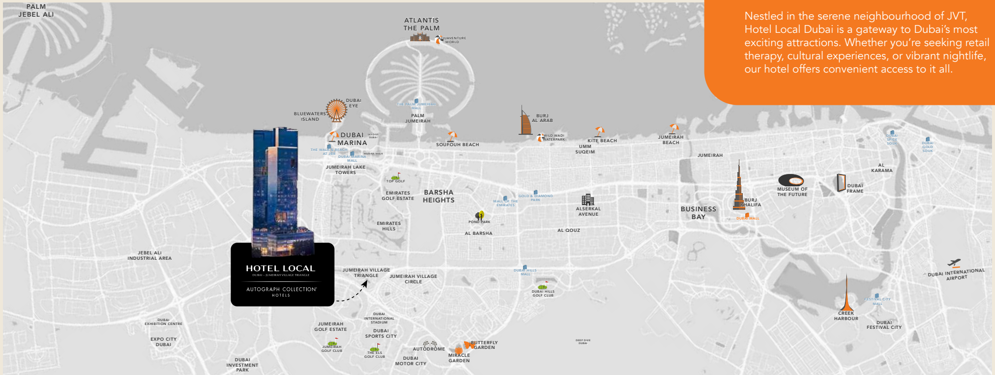
Hotel Local Dubai, Jumeirah Village Triangle, Autograph Collection, District 7, Dubai, UAE

Nestled in the serene neighbourhood of JVT, Hotel Local Dubai is a gateway to Dubai's most exciting attractions. Whether you're seeking retail therapy, cultural experiences, or vibrant nightlife, our hotel offers convenient access to it all.