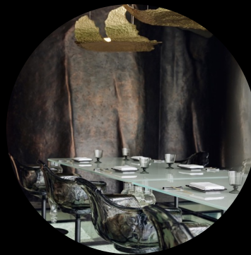
TAPASAKE PRIVATE DINING ROOMS