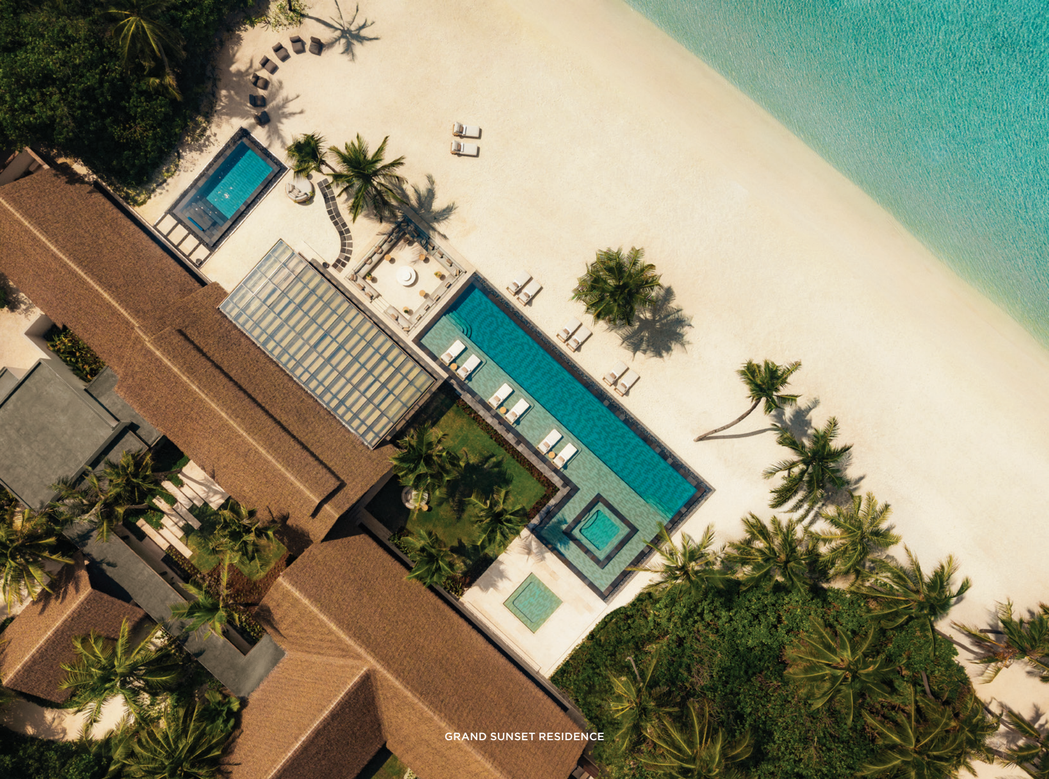
GRAND SUNSET RESIDENCE