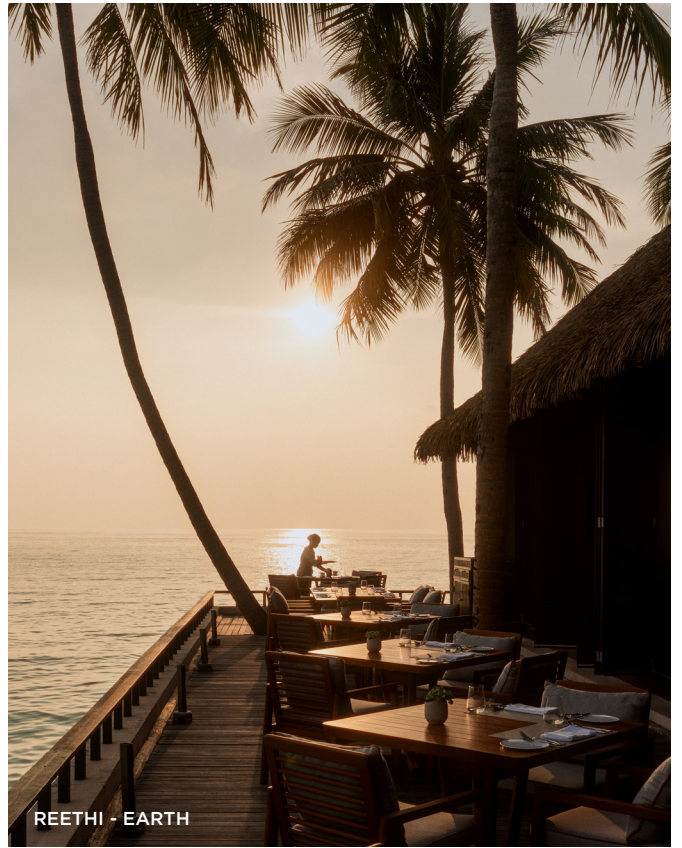
REETHI - EARTH