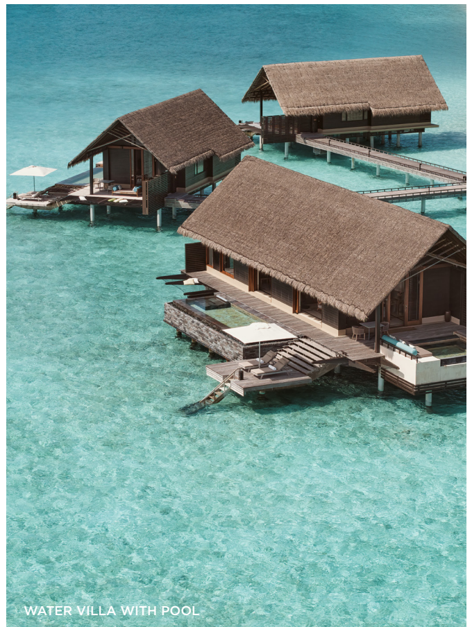
WATER VILLA WITH POOL

Welcome to one of the world's most magical destinations and discover a tropical paradise fringed with 12 pristine beaches. Spend endless days discovering your very own private island on barefoot or by bike and feel blissfully free.