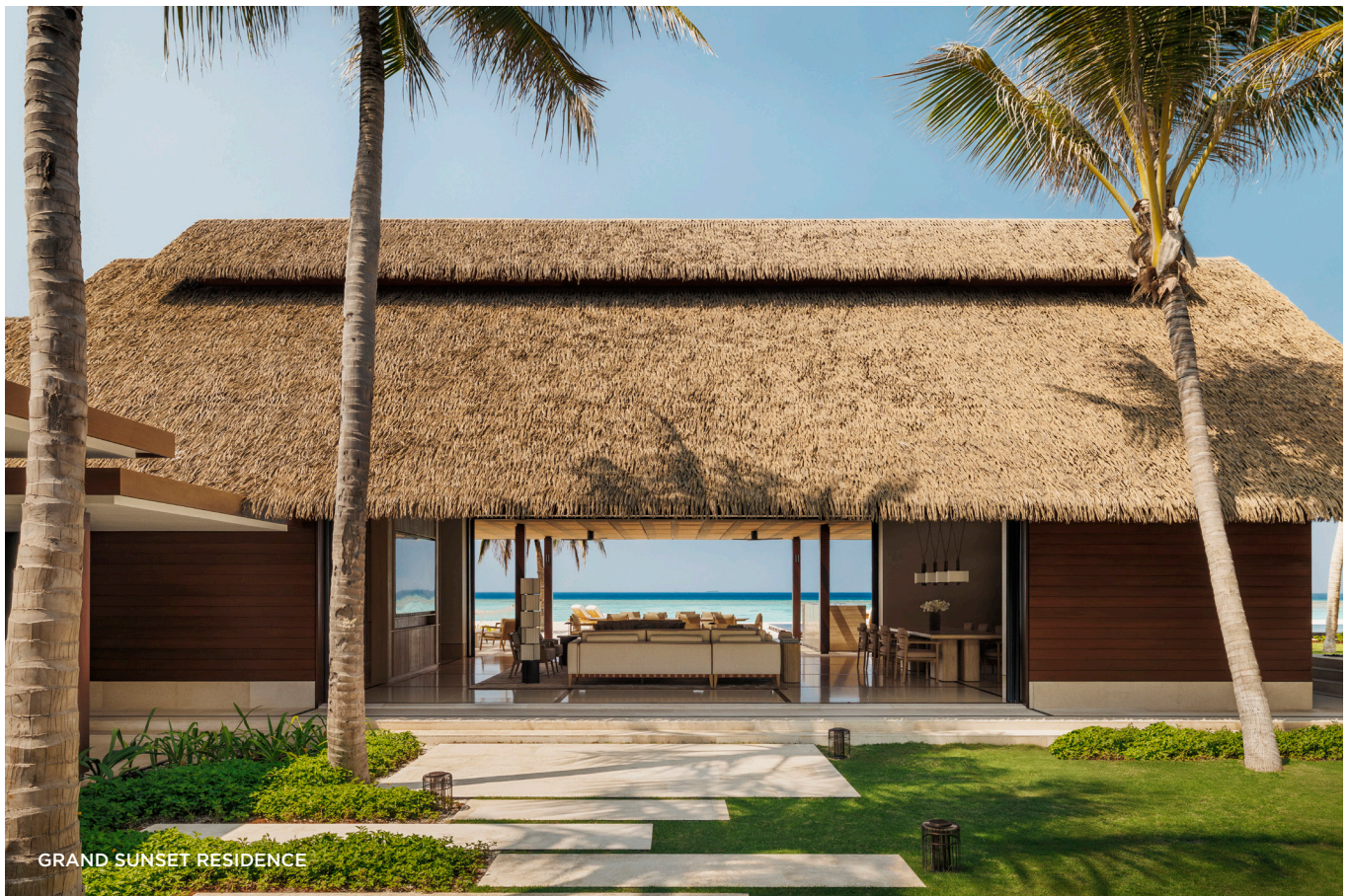
GRAND SUNSET RESIDENCE

Untethered from the outside world, One&Only Reethi Rah is an exceptional one-of-a-kind resort in the Maldives, evoking an unrivalled sense of freedom and privacy.