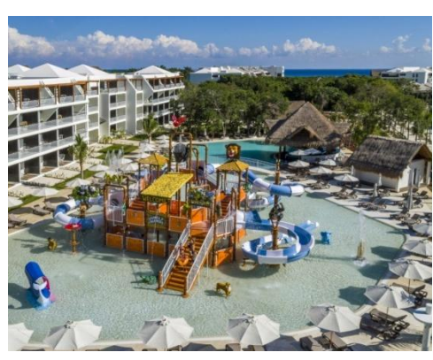
SWIMMING POOL NEXT TO THE BEACH