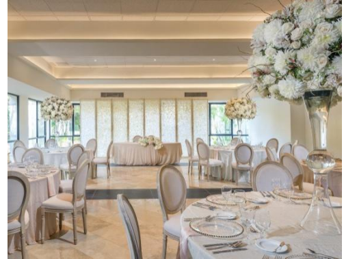
OCEAN I ROOM