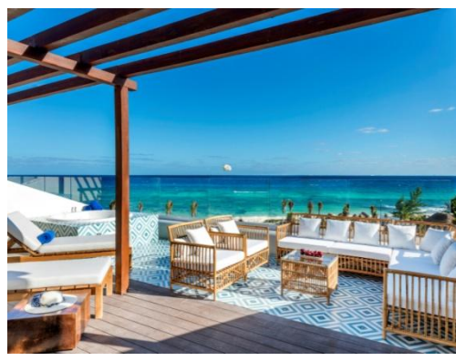
ROOFTOP MASTER SUITE

Master Suites: impressive rooms with a bedroom and a separate lounge. They include a private terrace with Jacuzzi. The following types of Master Suites are also available: