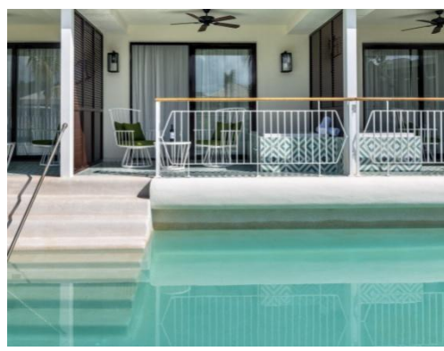
SWIM-UP JUNIOR SUITE

The views from the Master Suites vary according to their location.