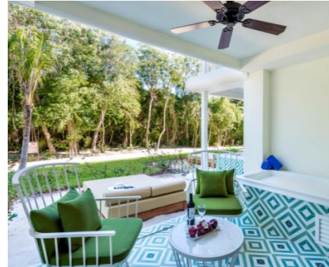
PRIVILEGE JUNIOR SUITE TERRACE