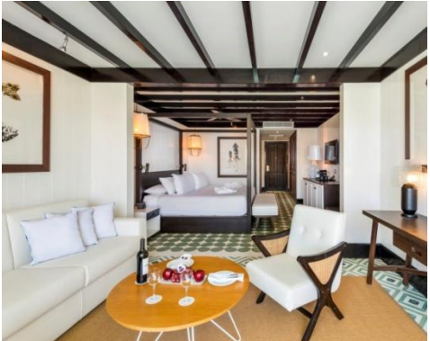
PRIVILEGE JUNIOR SUITE