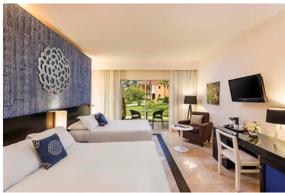
MAYA DELUXE – GARDEN VIEW

Flat-screen TV with international channels Alarm clock with MP3 connection Complimentary Minibar restocked daily with water, soft drinks and beer Coffee maker Complimentary in-room safe Air conditioning Iron and ironing board Fully equipped bathroom with shower, hairdryer and magnifying mirror Room service from 11 a.m. to 11 p.m.