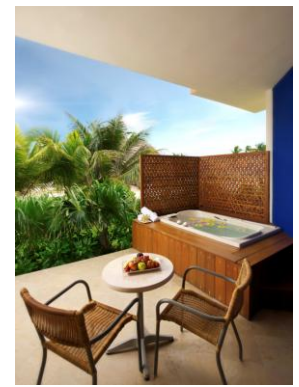
TERRACE WITH JACUZZI - PRIVILEGE HONEYMOON JUNIOR SUITE

Privilege Honeymoon Junior Suites: elegant rooms with a King Size bed and living room. They offer Privilege amenities (see Privilege section) as well as some exclusive services: