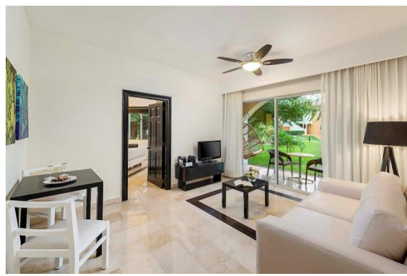
LIVING ROOM - PRIVILEGE ROMANCE SUITE

Privilege Romance Suites: cosy rooms that include a bedroom area, separate living room and furnished terrace overlooking the garden. They have a whirlpool in the bathroom and feature Privilege amenities (see Privilege section) as well as some exclusive services: