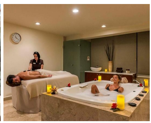
RELAXATION AREA TERRACE WITH JACUZZI PERSONALIZED TREATMENTS