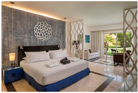
PRIVILEGE JUNIOR SUITE

Privilege Junior Suites: exclusive large rooms for guests who have signed up for Privilege, Exclusive Rooms and Services. They have a bedroom area with a King Size bed, living room and furnished terrace overlooking the garden. They offer special amenities in addition to all the comforts of the other rooms. For more details, see the Privilege section.