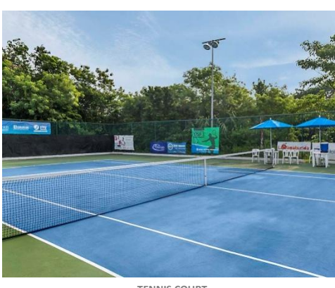
SHOWS THEMED NIGHTS TENNIS COURT