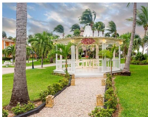
CELEBRATIONS ON THE BEACH