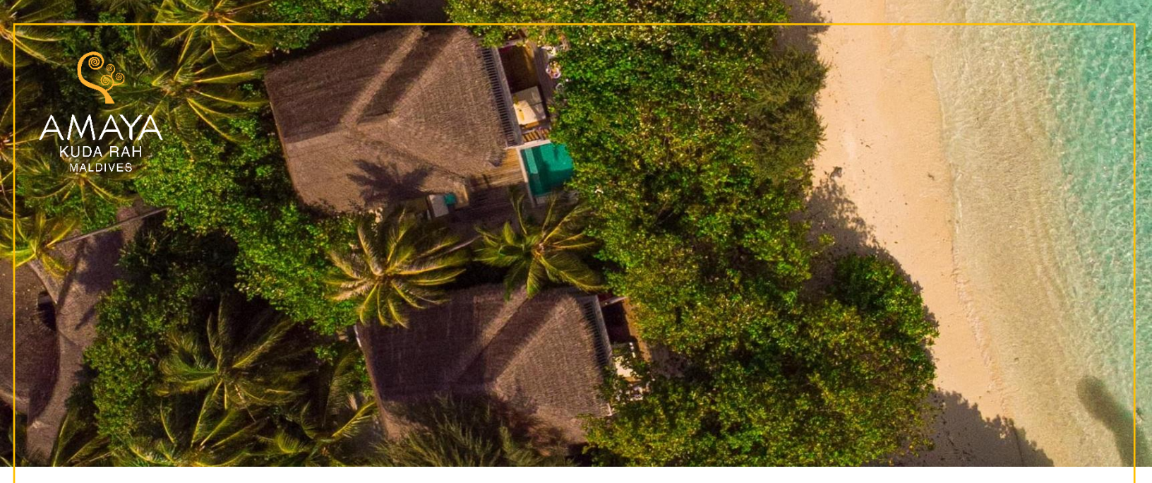
Escape yourself to enjoy the best of the luxurious experiences in our boutique paradise and rejuvenate with our exclusive offerings!