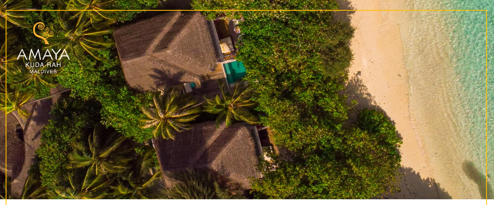
Escape yourself to enjoy the best of the luxurious experiences in our boutique paradise and rejuvenate with our exclusive offerings!