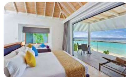
35 Two Bedroom Beach Houses - 205 sqm

Facing the turquoise lagoon, these villas feature oversized wooden decks with sunloungers, sun umbrella and daybed. The bedroom features a king-sized four-poster bed and a built-in sunlit daybed. The bathroom has a bath/shower, twin vanities, and a large outdoor area with a rainfall shower, outdoor daybed, and an inviting whirlpool (hot tub) on an elevated deck.