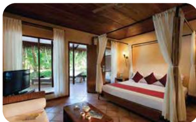
71 Beach Villas - 70 sqm

With four built together, the Garden Villas are simple yet stylish and feature a semi-open air bathroom with rainfall shower. Close to the beach and the pristine blue waters, they provide for our most affordable Kuramathi experience.