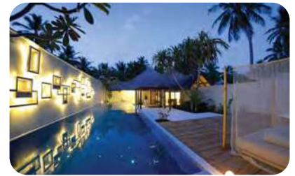
2 Honeymoon Pool Villas - 310 sqm

These villas are identical to the Water Villas with Pool, in style and in size, yet provide for even a better experience as they are located just on the edge of the famous Kuramathi sand bank.