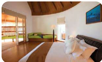
35 Superior Beach Villas - 90 sqm

Sited amongst the natural gardens of the island, the wooden Beach Bungalow features king-sized four-poster bed and an inviting daybed, whilst the deck outside offers daybed and sun loungers for two. The bathroom is large and open air, and includes a tempting hot tub in the corner.