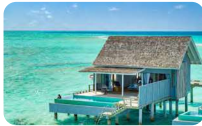
16 Thundi Water Villas with Pool - 142 sqm

Set right at the edge of the beach, enter the Pool Villas through your own private courtyard. The bedroom boasts views out to the infinity pool (18sqm) matching the picturesque vista beyond. The villa is furnished with a walk-in wardrobe and an indoor bathroom complete with a free standing bath, twin vanity, and a separate outdoor rainfall shower.