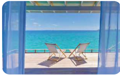
30 Deluxe Water Villas - 115 sqm

These magnificent villas are built on stilts, close to the house reef with its colourful myriad of marine life. The villa features an airy bedroom with king bed and a spacious bathroom with twin vanities and rainfall shower. The villas also include an oversized two-tiered sundeck with your whirlpool (hot tub), sun loungers and sun umbrella. Enjoy panoramic views of the Indian Ocean.