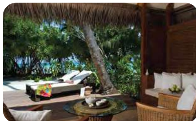
31 Deluxe Beach Villas - 95 sqm

These villas are contemporary in design. Round in shape, the villa includes a wooden deck featuring an alluring built-in outdoor daybed and sunloungers. The bedroom is spacious and minimalist, displaying a modern king-sized low bed as the centrepiece. The open air bathroom leads to an outdoor whirlpool (hot tub). The added luxury of an espresso machine with complimentary refill is included from this villa category upwards.