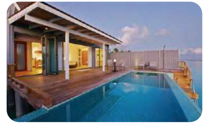
33 Water Villas with Pool - 142 sqm

Set in the middle of our vast turquoise lagoon, the Deluxe Water Villa feature a king-sized bed and a daybed. The spacious bathroom offers a freestanding bath, and opens onto an expansive deck with steps down to the azure waters. In addition to the wide range of in-villa amenities, all villas from this category upwards also feature a wider minibar complete with a separate wine chiller featuring over 30 bottles from around the globe.