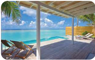
12 Pool Villas - 165 sqm

The Water Villas with Pool are located either in the crystal clear lagoon or facing the house reef, all featuring modern interiors similar to the Deluxe Water Villas. These villas also include a private pool (18sqm) overlooking the ocean.