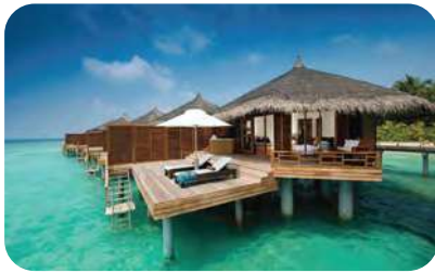
50 Water Villas - 90 sqm

These magnificent villas are built on stilts, close to the house reef with its colourful myriad of marine life. The villa features an airy bedroom with king bed and a spacious bathroom with twin vanities and rainfall shower. The villas also include an oversized two-tiered sundeck with your whirlpool (hot tub), sun loungers and sun umbrella. Enjoy panoramic views of the Indian Ocean.