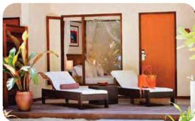
12 Garden Villas - 45 sqm

Check-in is at 14:00hrs, check-out is at 12:00hrs.