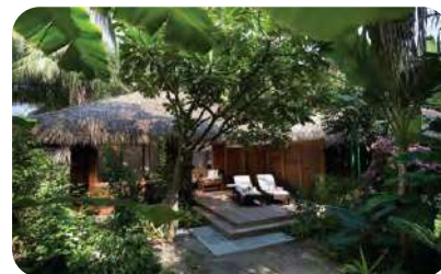
33 Beach Bungalows - 90 sqm

The Beach Villas are individual villas hidden within the abundant vegetation, yet only a few steps away from the beach. Facing the lagoon side of the island, they feature king-sized four-poster beds, wooden decks at the front with daybed and sunloungers. The Beach Villas also include semi-open air bathrooms with outdoor rainfall shower.