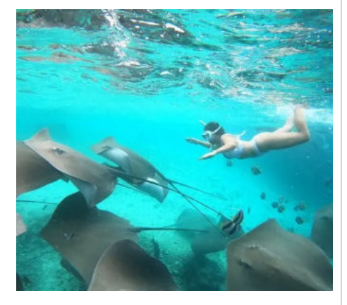
STINGRAY SNORKELING & DOLPHIN WATCHING