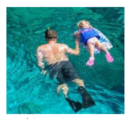
$100++ PER GUIDE PER TRIP