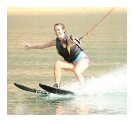
WATER SKI Pro Rides (20 Minutes) $70++ Lesson (30 Minutes) $155++ (Per person)