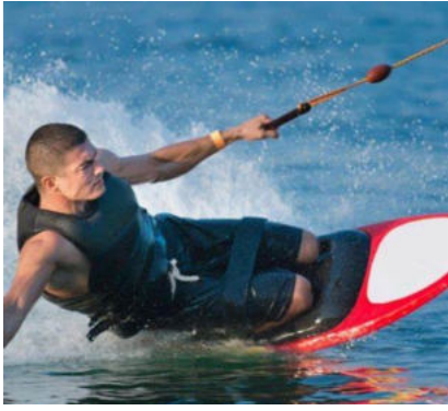
KNEE BOARDING Pro Rides (20 Minutes) $70++ Lesson (30 Minutes) $155++ (Per person)