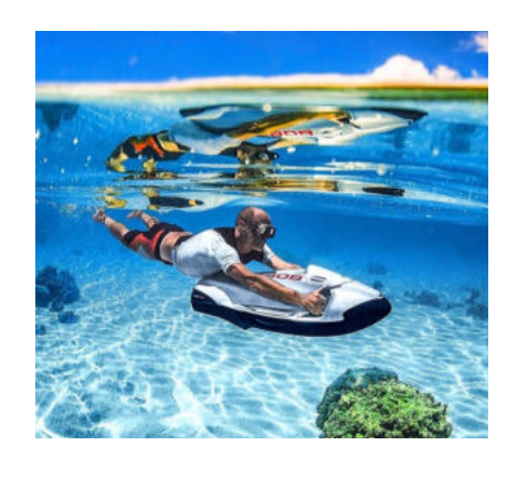
SEABOB 15 Minutes $80++ 30 Minutes $140++ (Per person)