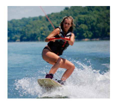
WAKEBOARDING PRO RIDES (20 MINUTES) $70++ LESSON (30 MINUTES) $155++ (PER PERSON)