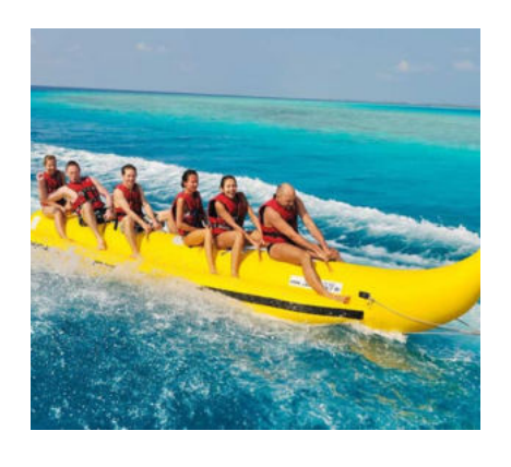
BANANA BOAT 15 Minutes $50++ (Per Person)