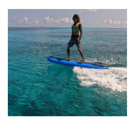
LAMPUGA 15 Minutes $95++ 30 Minutes $185++ (Per person)