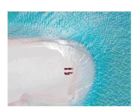
PER PERSON $120++