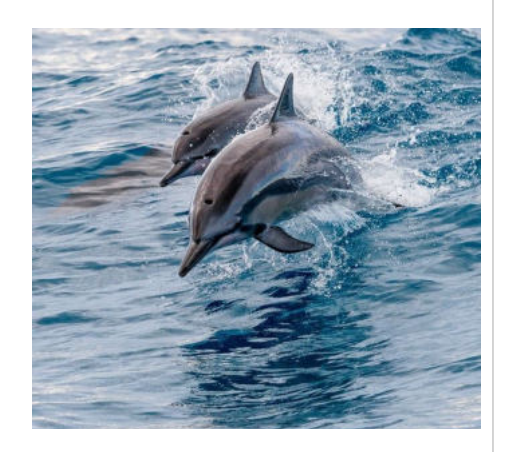
PER PERSON $150++