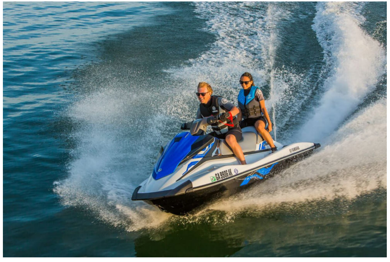
15 Minutes $95++ 30 Minutes $185++ 1 Hour $220++