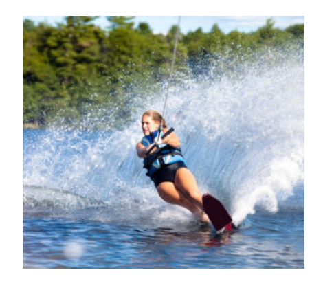
MONO SKI Pro Rides (20 Minutes) $70++ Lesson (30 Minutes) $155++ (Per Person)