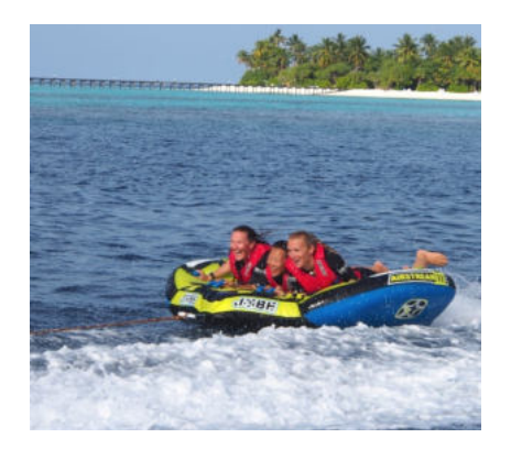
FUN TUBE 15 Minutes $50++ (Per Person)