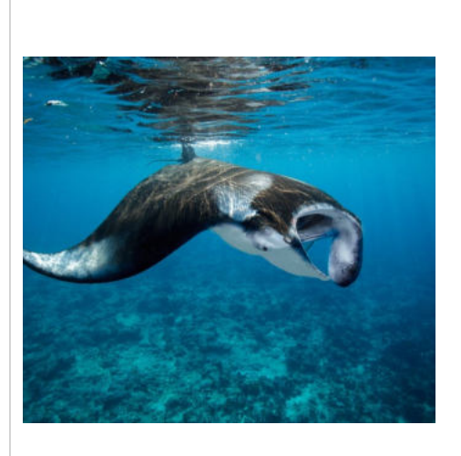
PER PERSON $250++