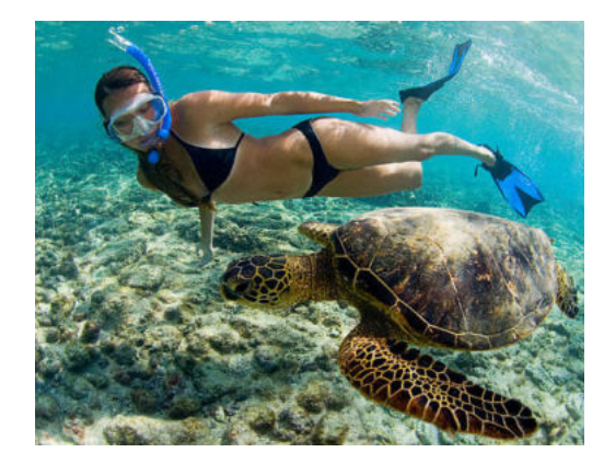
TURTLE SNORKELING & SAND BANK VISIT