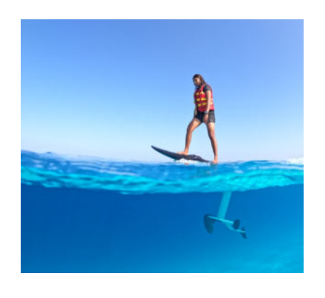
E-FLITE 30 Minutes $175++ (Per person)