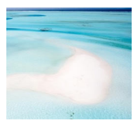
SAND BANK VISIT