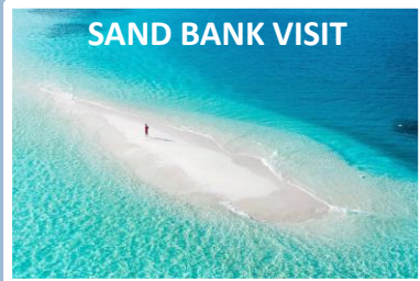
SAND BANK VISIT