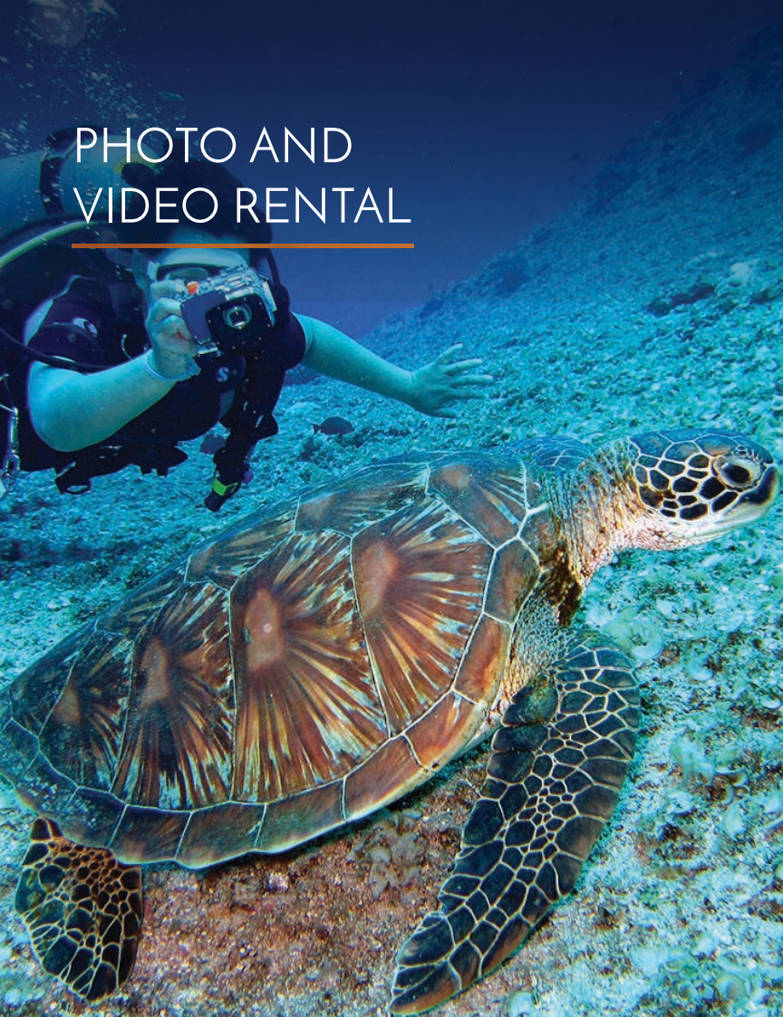
PHOTO AND VIDEO RENTAL

Rent a GoPro to capture the treasured moments underwater. Capture amazing footage and photos of the beautiful marine life in stunning high definition.