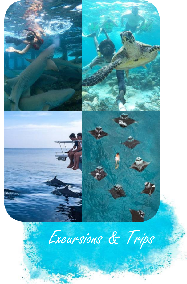
There is more to cherish your perfect Maldives holiday. Enjoy a variety of outdoor activities, visits to spectacular ocean retreats and outstanding natural beauty with our professional excursions and leisure team. We have custom-made excursions tailored just for you.