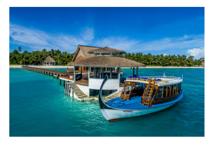
SuvaDiva Divers is committed to providing customer satisfaction along with great dive experiences.

Guests can take full advantage of the resort with SuvaDiva Divers - our PADI Five Star Dive Center & Water Sports Arena. We offer courses and adventures to the best dive sites of the Atoll for sharks and pelagic encounters, easily reachable by a 15 minute boat ride from the hotel;