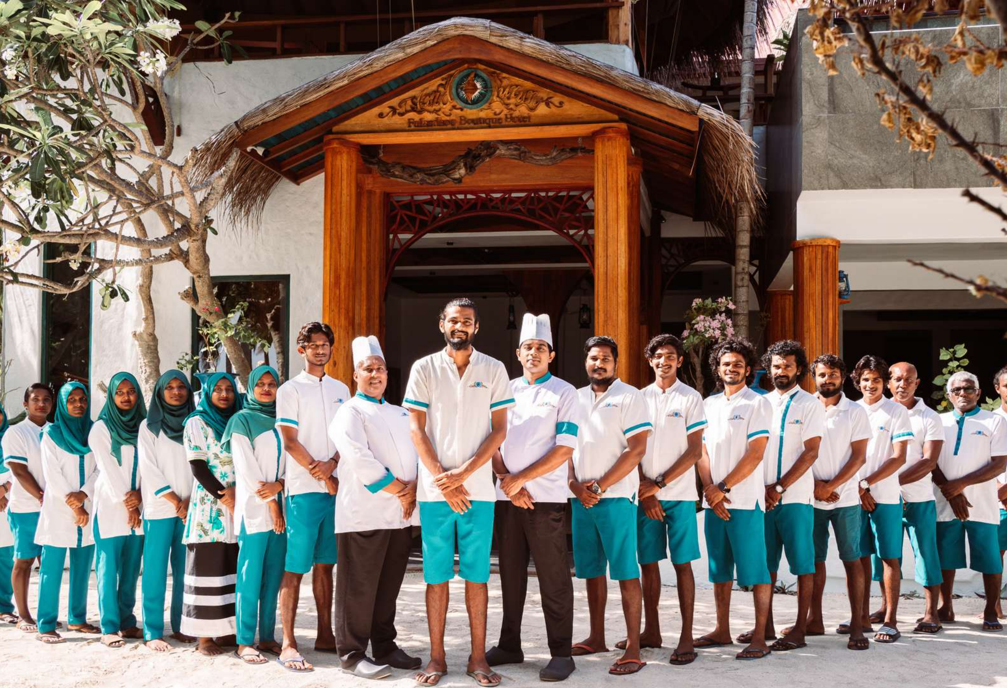
ISLAND LUXURY FULHADHOO BOUTIQUE HOTEL