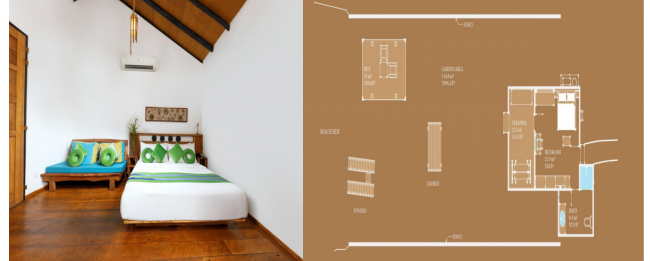
Beach Villa (Veli) 43 sqm ( inc. veranda )