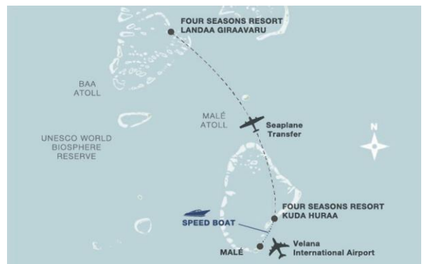
Four Seasons Resort Maldives at Landaa Giraavaru Baa Atoll, Baa Atoll, MV-20 20097, Republic of Maldives