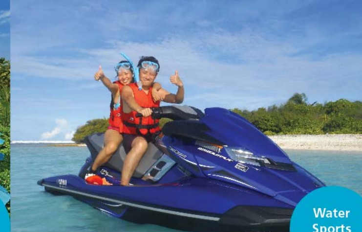
Water Sports Centre

Whether you crave a gentle paddle or an adrenalin rush, our Water Sports Centre has the right activity for you! Qualified personnel will advise and instruct you to ensure maximum fun and safety. Activities include fun tubing, sailing, water skiing, canoeing, wakeboarding, windsurfing, private jet skiing and speed boating with dolphins and underwater sights.