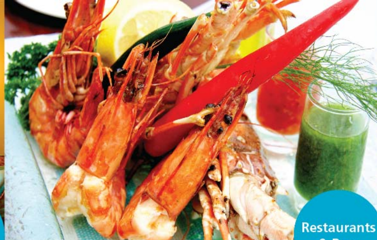
Restaurants & Bars

Enjoy gentle breezes while listening to the sound of waves and take in the view of clear waters right to the horizon.