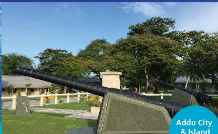
Addu City & Island Tours

Experience a relaxing cruise in search of wild dolphins while viewing the rising sun over the Indian Ocean. Maldives is home to several species of dolphins, including spinners and bottlenosed dolphins, and pilot whales. They can be seen gracing the waters near our island. Watch them jump and do their friendly tricks as they frolic and play in the wake of your boat.