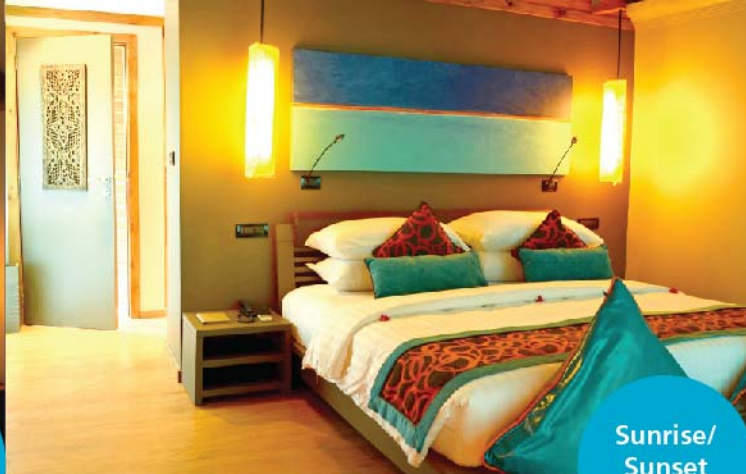
Sunrise/ Sunset Villas

A private outdoor enclosed area features a jacuzzi for two to soak under the stars along with a sundeck and lounge.