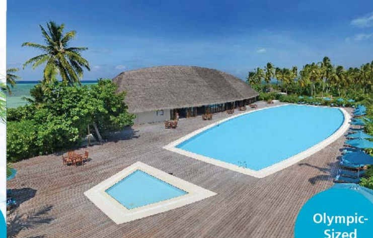
Olympic- Sized Pool

Grab your tanning lotion for a sun-drenched time. Have the whole family along for a splash-athon at our massive 50m long pool.