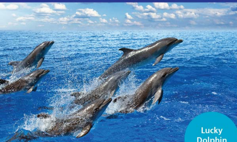
Lucky Dolphin Cruise

Experience a relaxing cruise in search of wild dolphins while viewing the rising sun over the Indian Ocean. Maldives is home to several species of dolphins, including spinners and bottlenosed dolphins, and pilot whales. They can be seen gracing the waters near our island. Watch them jump and do their friendly tricks as they frolic and play in the wake of your boat.