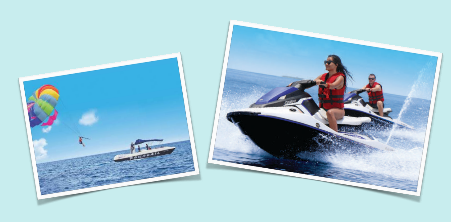
Prices are per person and in US Dollars subject to 10% service charge and other applicable government taxes