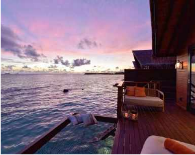
Lagoon water villa