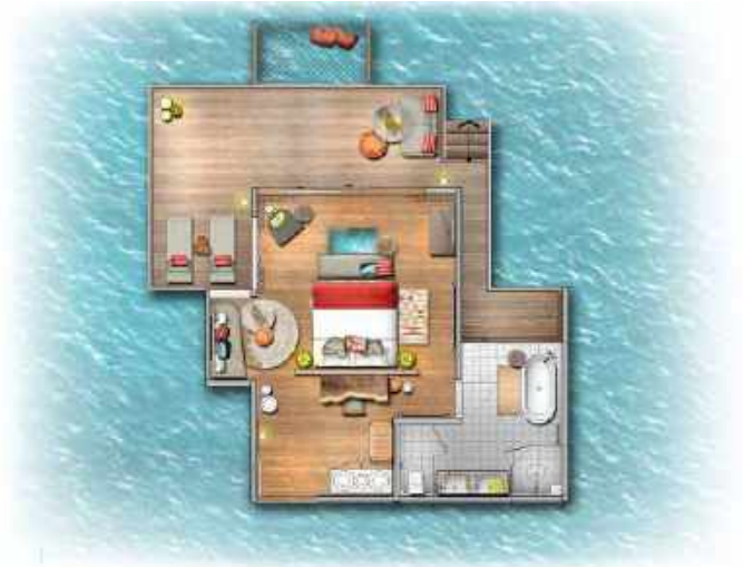
Ocean water villa