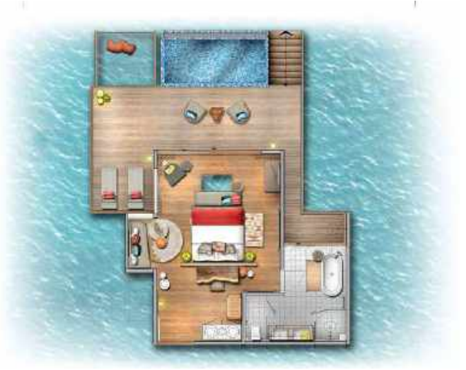
Reef Pool water villa