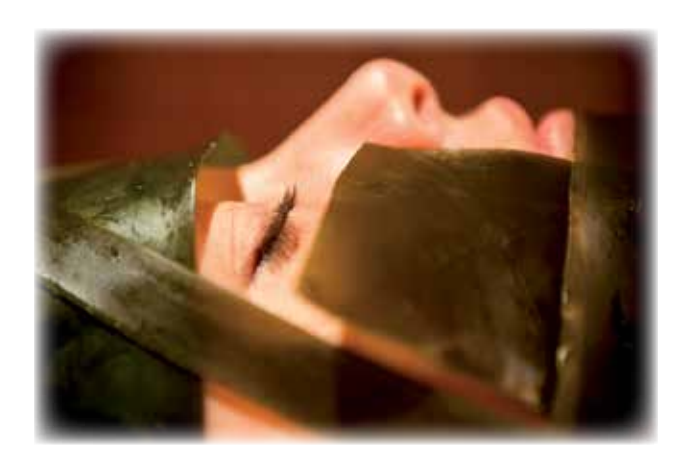
For better results we recommend the use of home care products!

Facial therapy with Laminaria 70 min | 100.00 lv Eye contour therapy with whole algae 30 min | 60.00 lv Facial massage 30 min | 60.00 lv