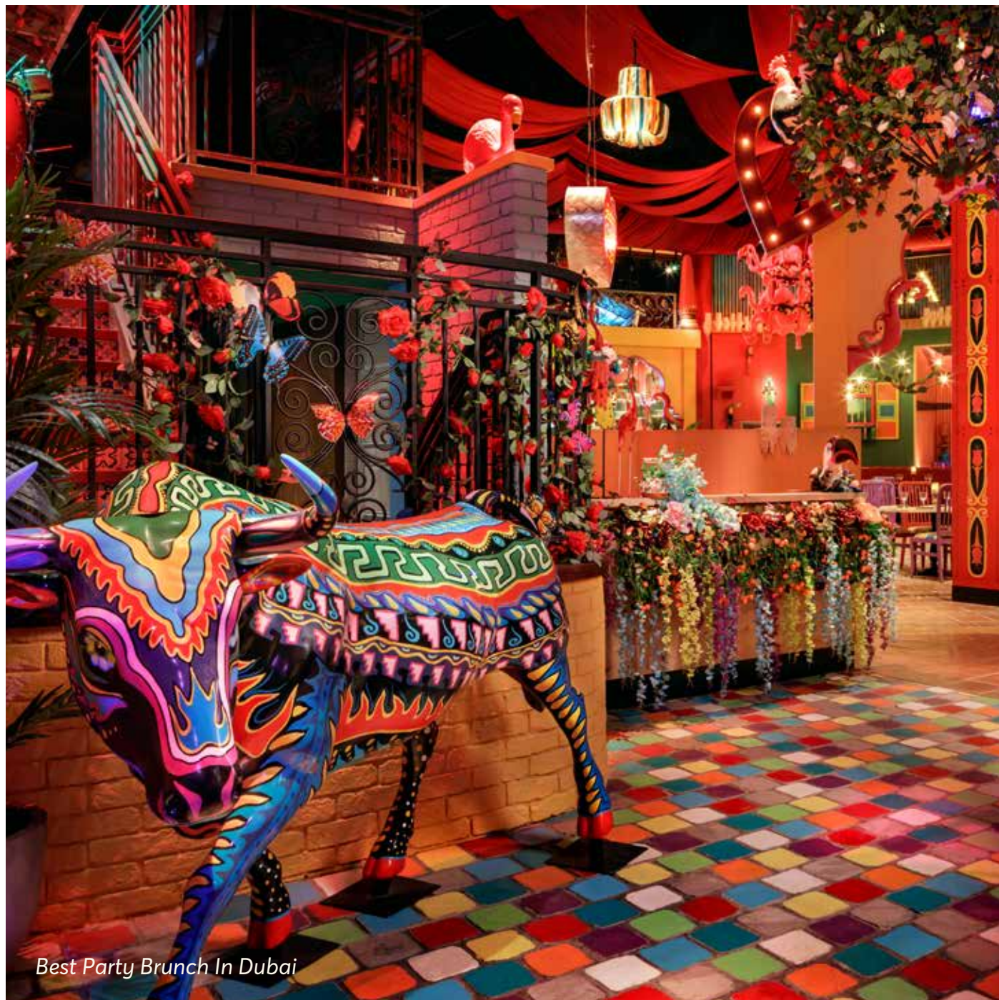
Best Party Brunch In Dubai