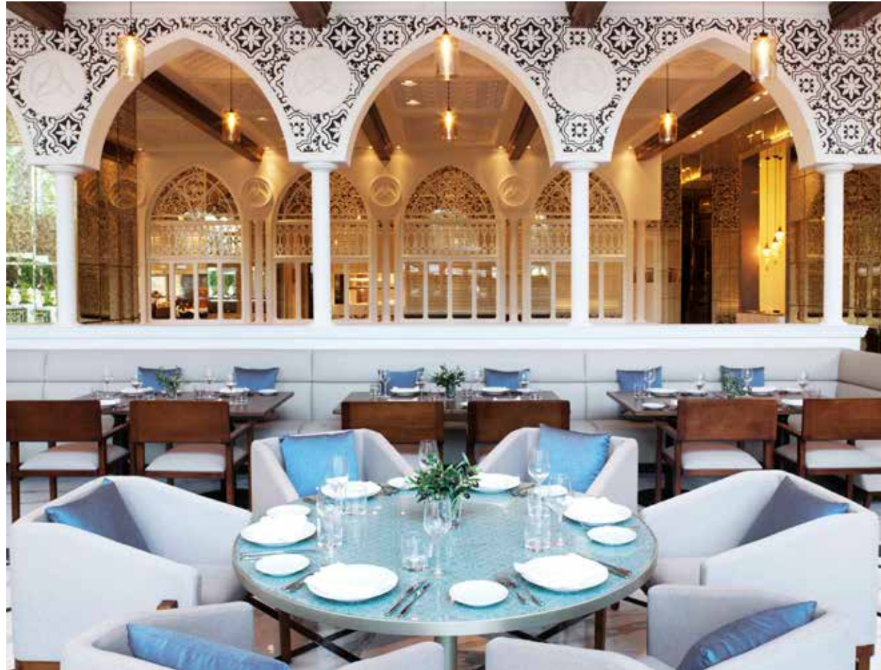
One Of Dubai's Leading Arabic Restaurants