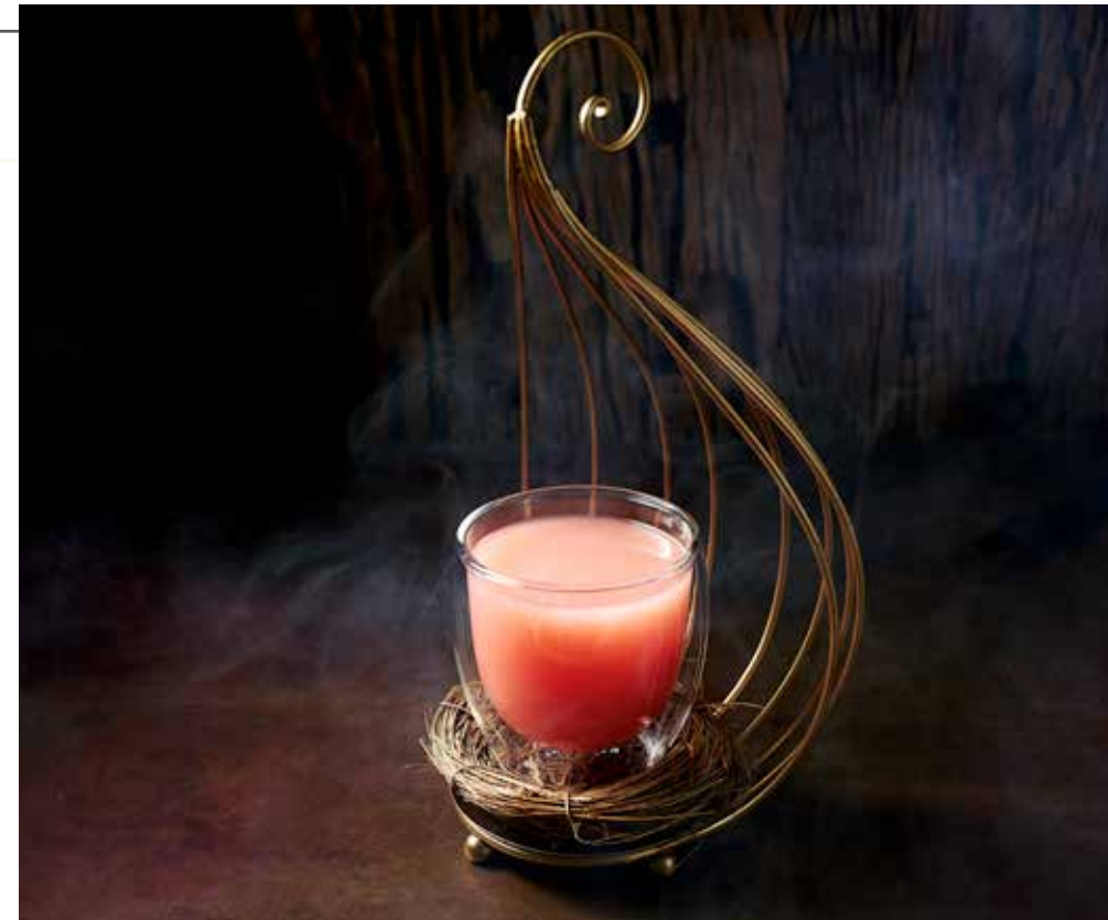
Relaxing Shisha And Bar Terrace