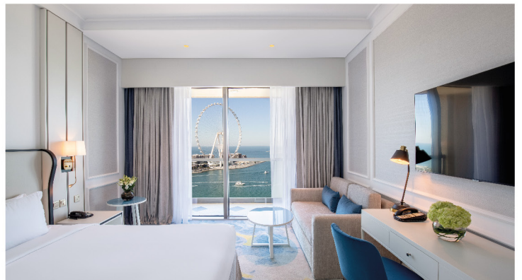
Renovated Luxury room