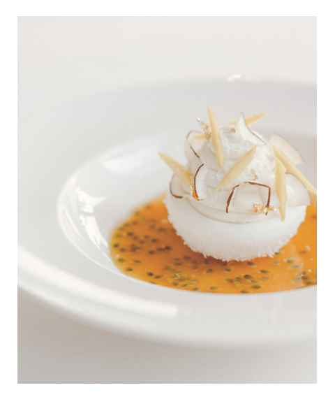
Moana Family-friendly restaurant

Brunch buffet with soft beverages: AED 499 Brunch buffet with free-flowing house beverages: AED 649 Young adults (12-20 years): AED 249 Adults friendly from 12 years and above