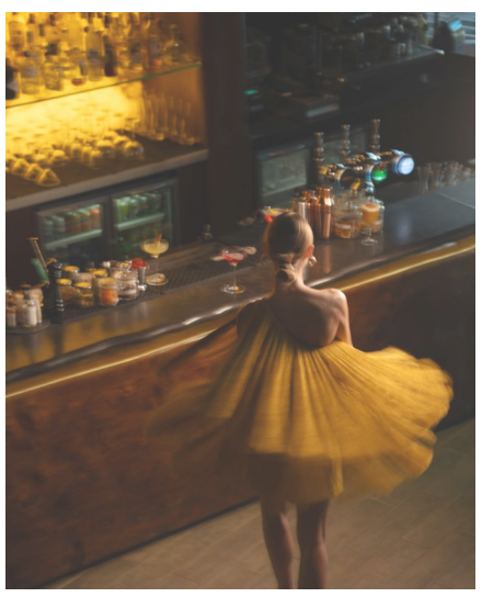
Porterhouse Bar and Grill Adult-friendly restaurant

Brunch buffet with soft beverages: AED 499 Brunch buffet with free-flowing house beverages: AED 649 Young adults (12-20 years): AED 249 Children (6-11 years): AED 149 Below 6 years dine free