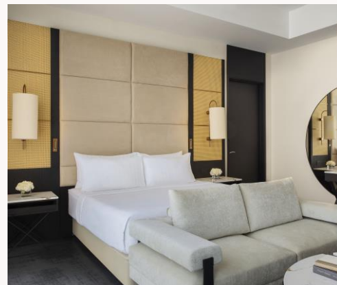
Luxury City View Room With Balcony