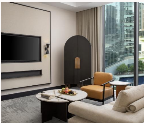
Deluxe Pool View Room