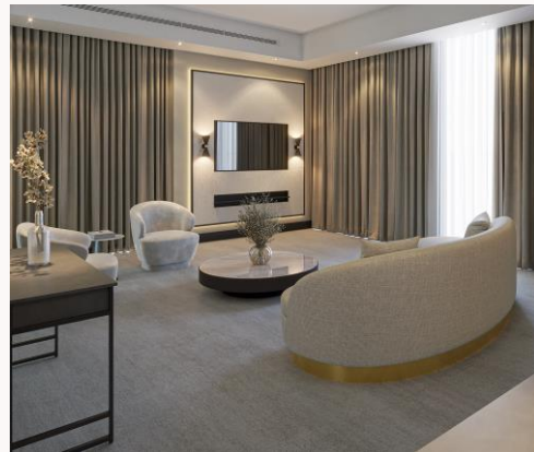
Anantara Royal Suite with Pool