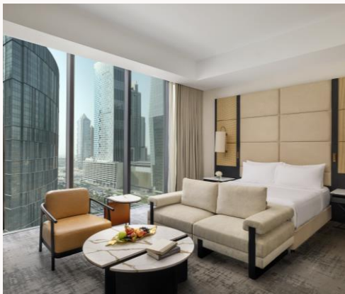
Superior City View Room