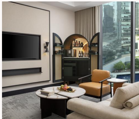
Superior Pool View Room