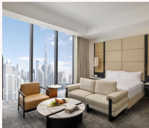
Luxury Burj Khalifa View Room