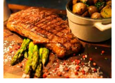
Howdy's Sports Bar & Restaurant Open Daily, 12 PM - 12 Midnight

Call/WhatsApp: +971 56 726 6350 / +971 55 929 4184