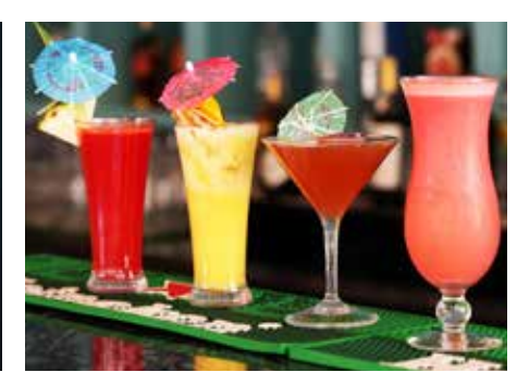
Taky Lounge (Pool Bar) Open Daily, 9 AM - 10 PM

Call/WhatsApp: +971 50 625 8829 +971 54 341 2212