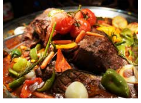
Makan All-Day Dining Restaurant Open Daily, 6:30 AM - 10:30 PM

Offering international cuisine. Serving breakfast, lunch and dinner.