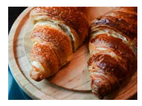
Gazebo Café (Lobby Lounge) Open Daily, 8 AM - 12 Midnight

Call/WhatsApp: +971 56 726 6350 /+971 55 929 4184