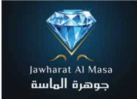
Jawharat Al Masa

Open Daily, 9 PM - 4 AM (indoor) 5 PM - Late (terrace)