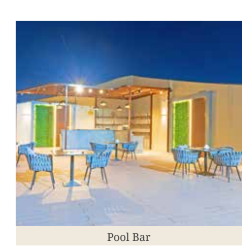
A restaurant serving light snacks and refreshing beverages by the pool.