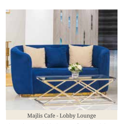
The welcoming lobby lounge of our hotel that embraces the community of this residential area inviting you to reflect, relax or socialize in a traditional Emirati decor.