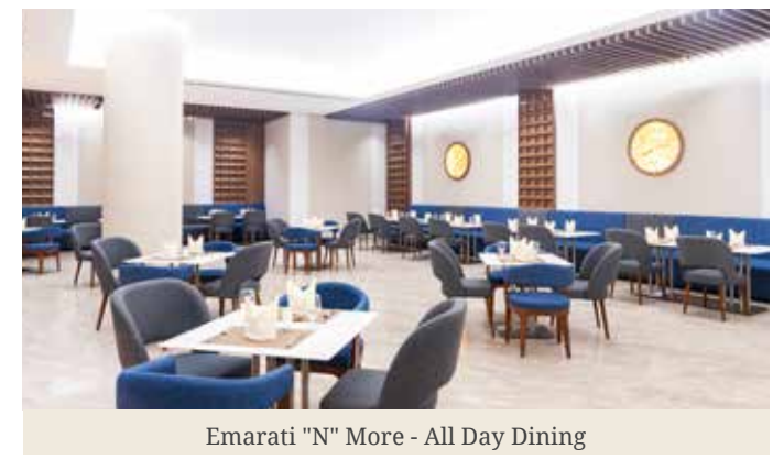
The all-day dining buffet restaurant serves a wide range of international dishes and an a la carte menu located at the lobby level.

Four venues offer a wide choice of mouth-watering specialties in cozy, tranquil and relaxing surroundings.